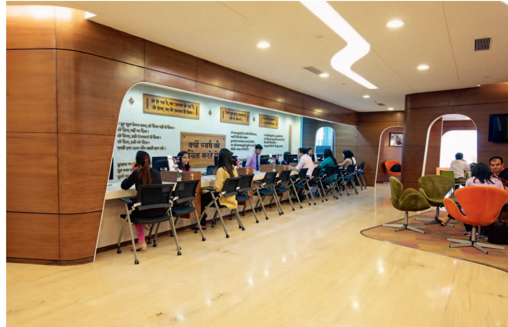
Dedicated Client Services teller counters at Vatika Triangle, handling approximately 1500 walk-in queries a month