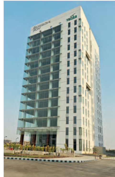
Vatika Professional Point, located on Golf Course Extension Road, Gurgaon, is ready for fit-outs

Joy of working will soon become more joyful with the opening of two new Business Centres in Gurgaon at Vatika Business Park, Sohna Road and Vatika Triangle, MG Road