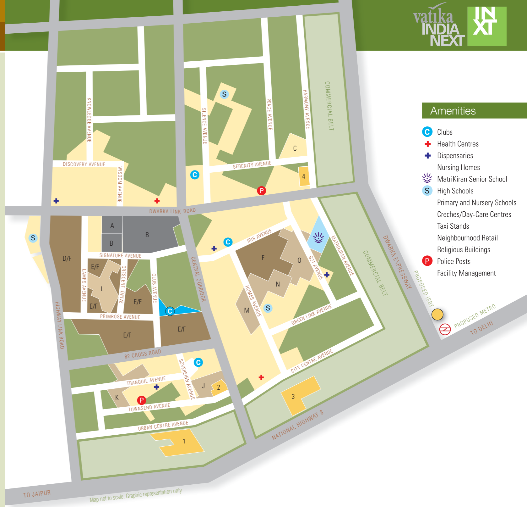
Map not to scale. Graphic representation only