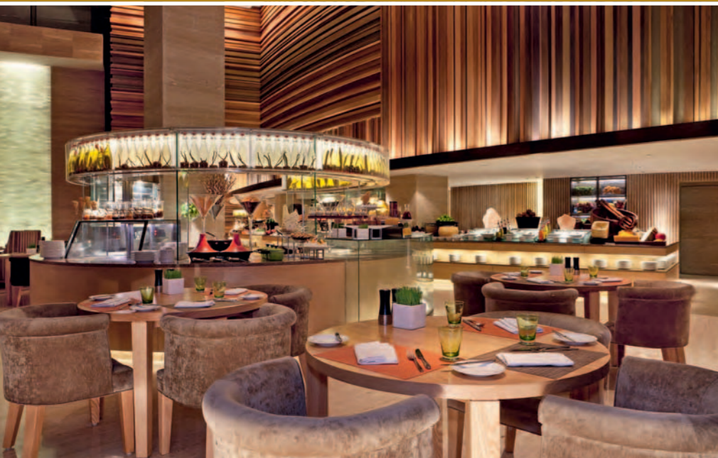
Seasonal Tastes @ hotel lobby