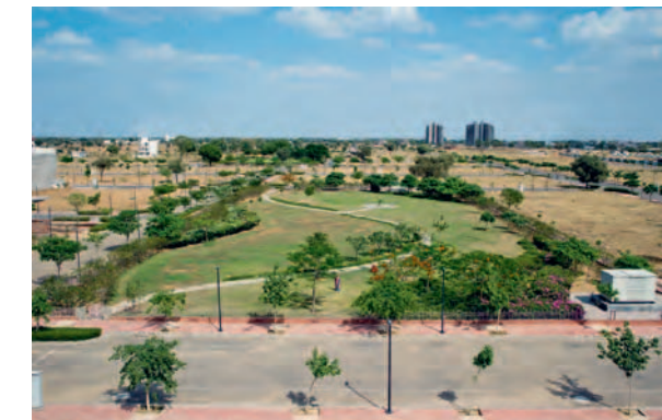
View of the Lantana Park spread across approximately 4 acres* (*1 acre = 0.404 hectare)