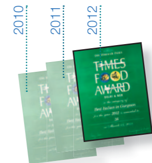
56 is voted the best once again!