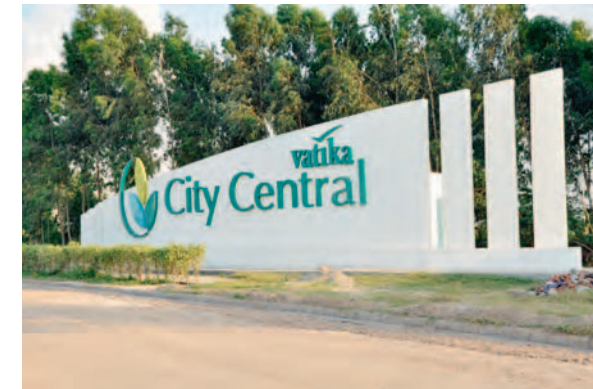
Entrance marker at Vatika City Central, Ambala