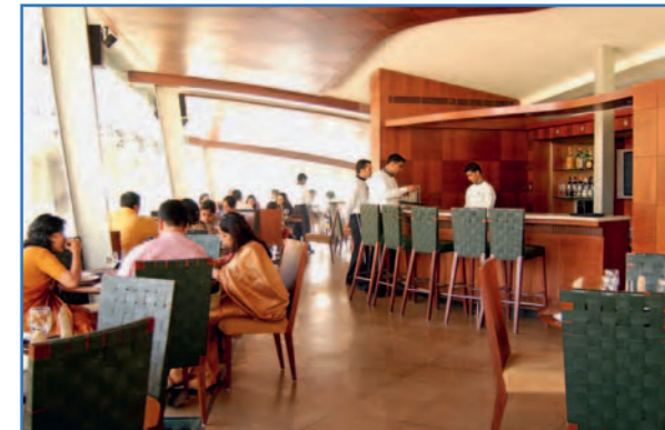
Coriander Leaf is soon to be in three locations, two in Gurgaon, and one in Mumbai