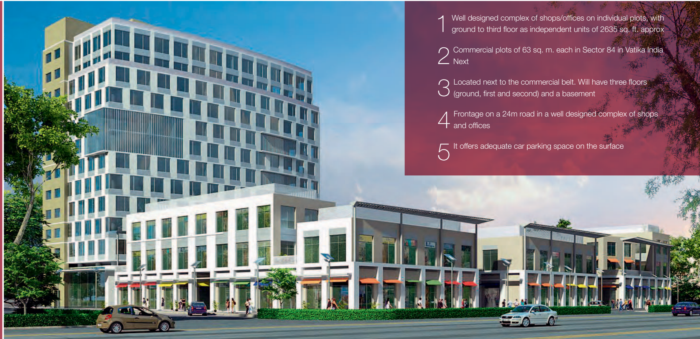
Town Square is an office-cum-retail complex located at the entrance of Vatika India Next, Gurgaon