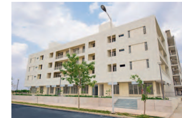
Actual view of Retail and Residential Complex at The Park Apartments