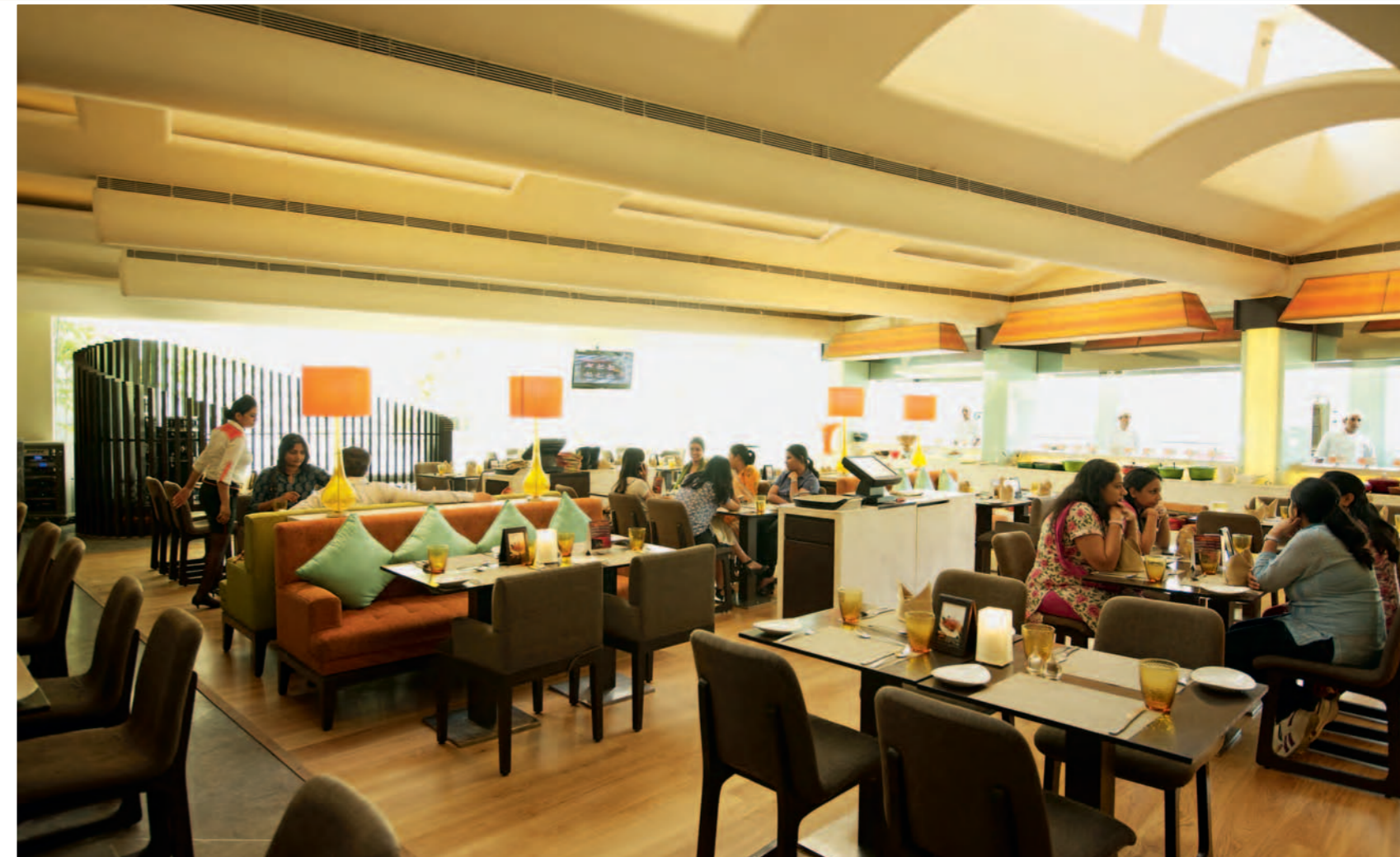
Fox – World Cuisine restaurant on MG Road, Gurgaon