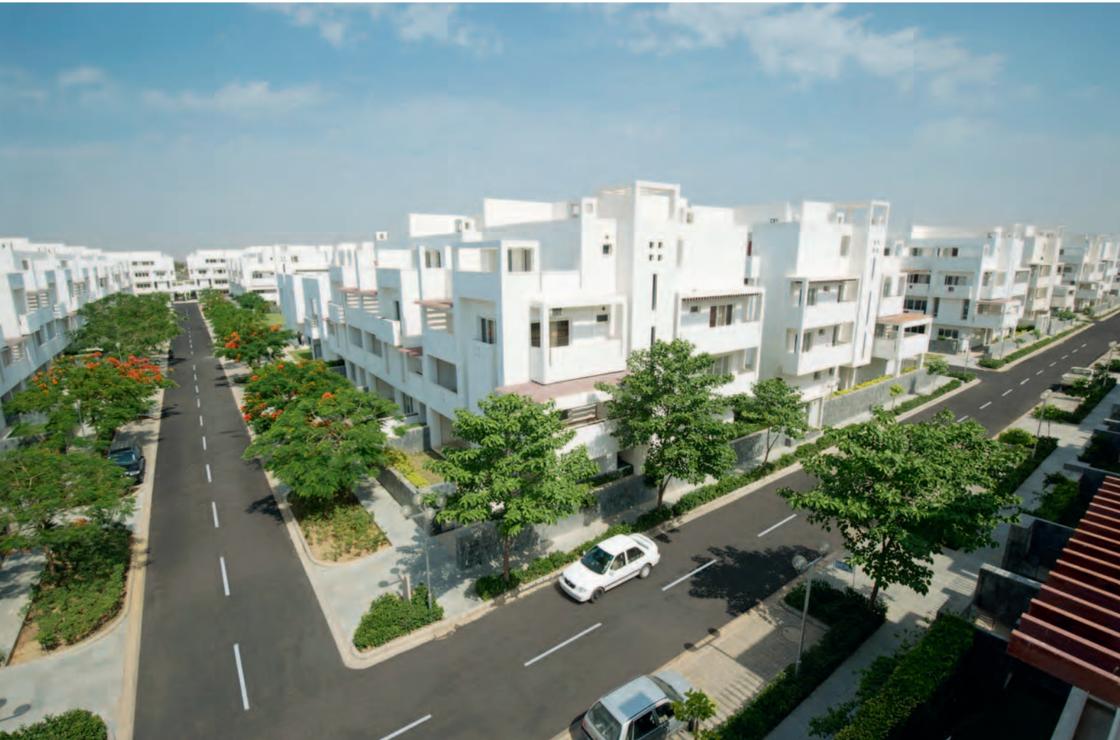
Urban Woods - An immaculately planned row housing development with wide roads, lush greenery, open refreshing spaces and thoughtfully designed houses