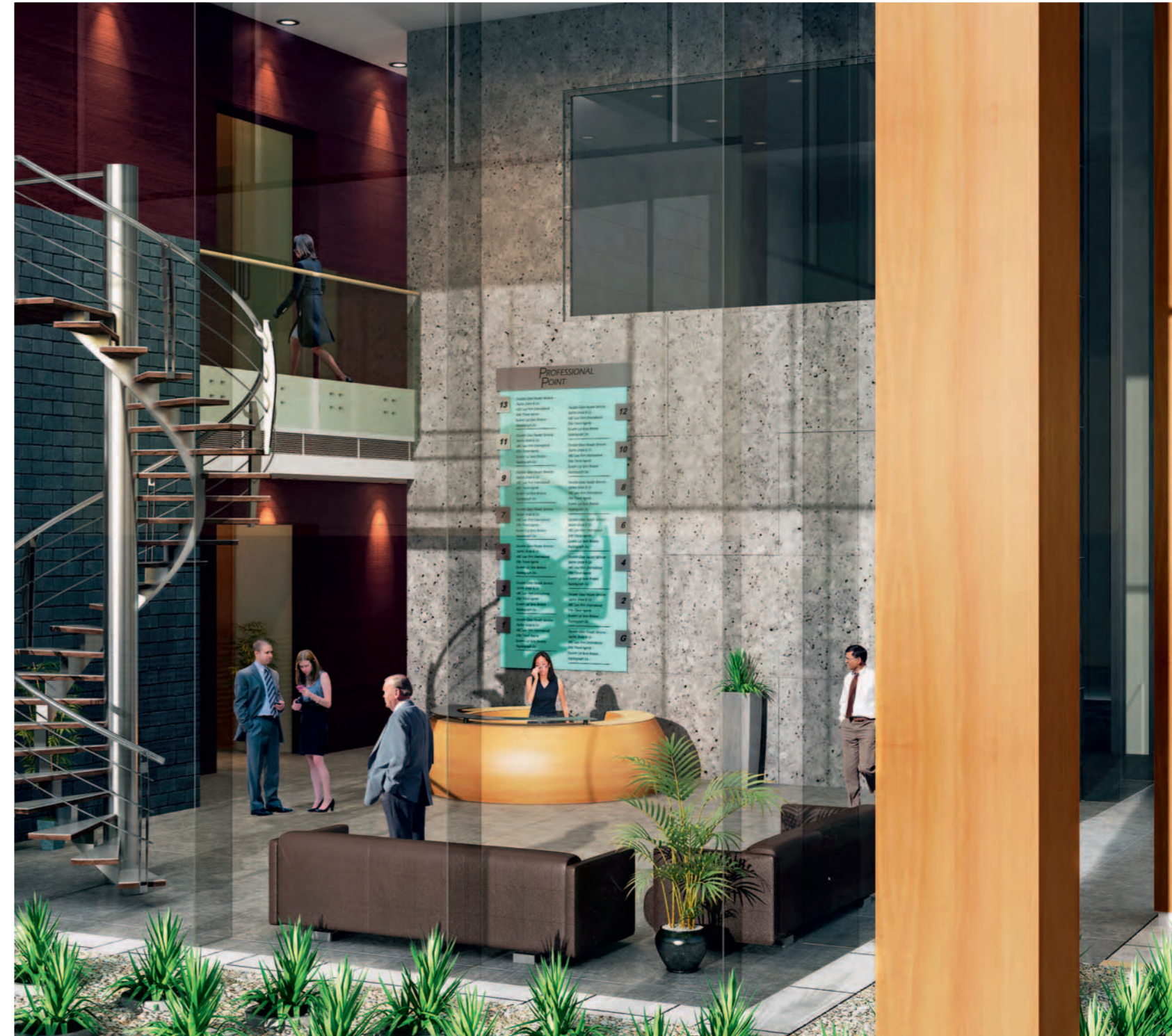
The double height entrance lobby at Vatika Professional Point, greets visitors with a sense of scale and largesse