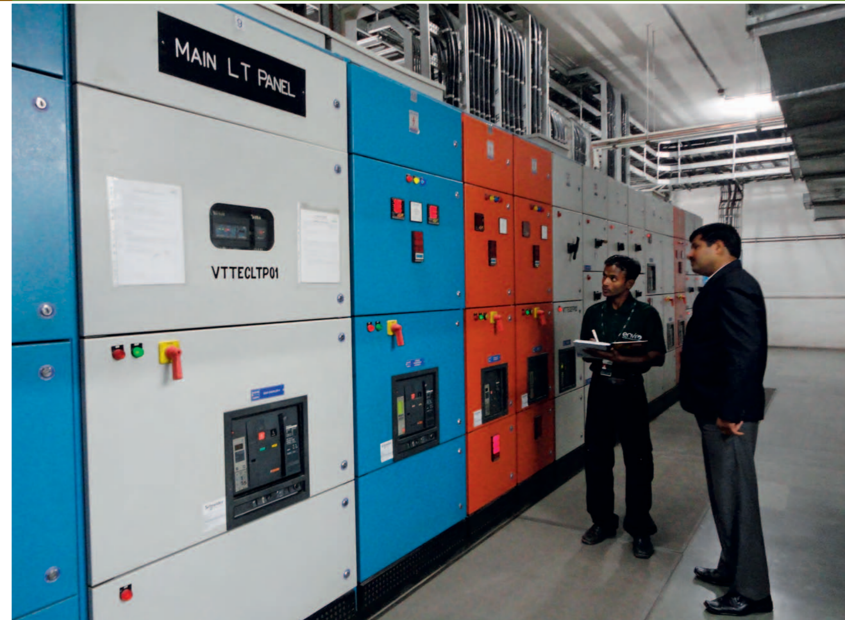
Technical maintenance and operations by Enviro