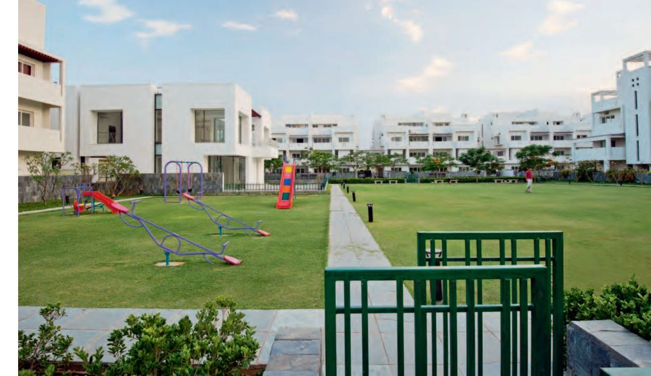
Urban Woods Club is now open to meet all your social and recreational needs