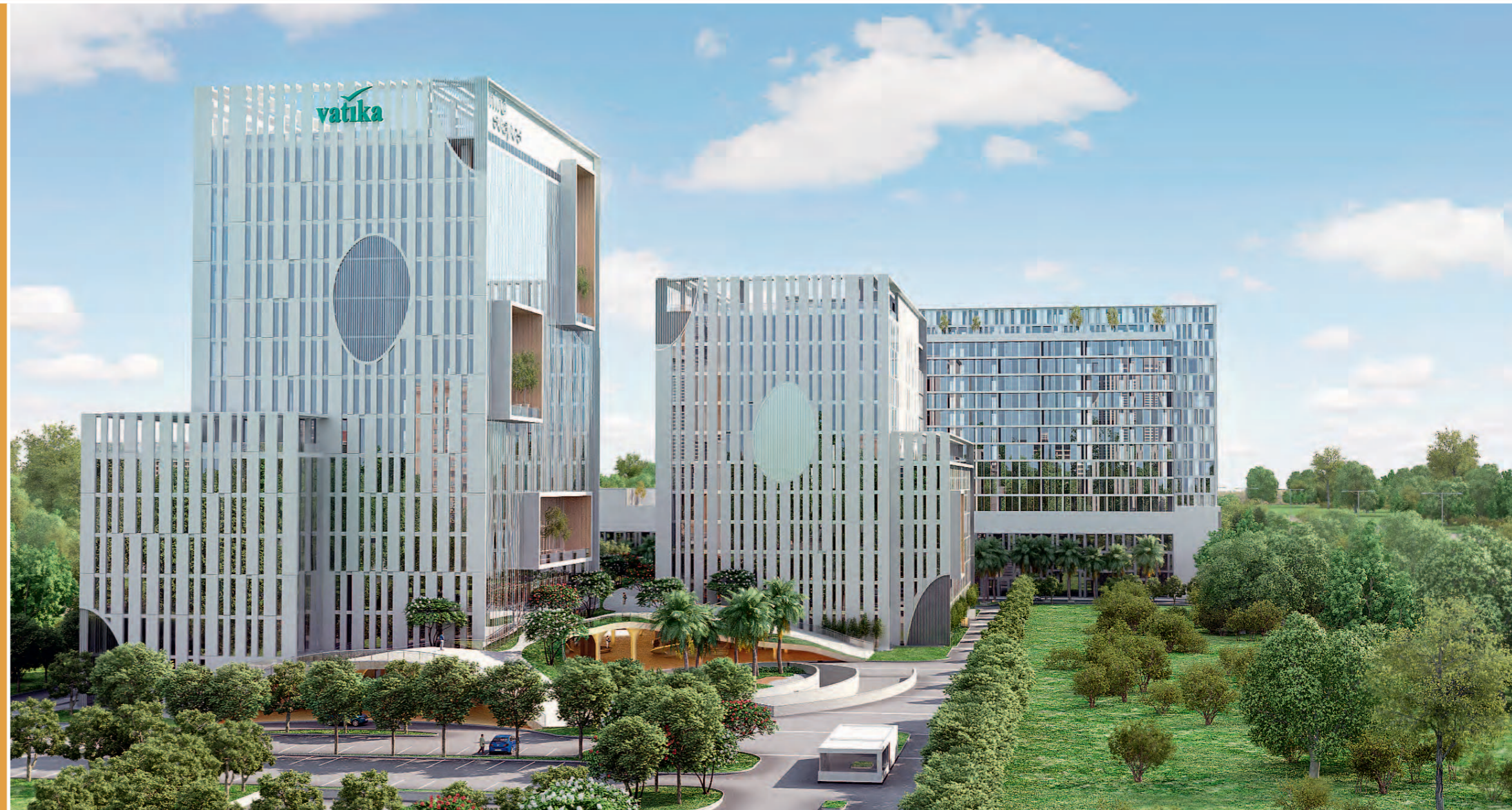
Vatika Mindscapes – A-Grade Commercial Complex on main Mathura Road