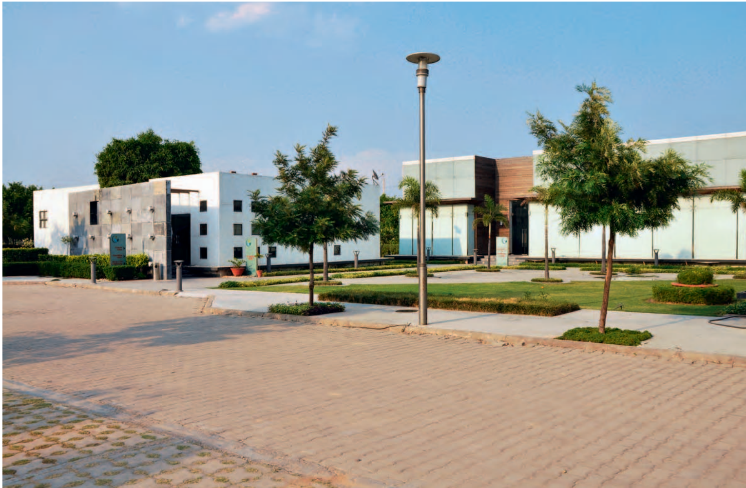
73 hectares of World-Class township located in Sector 23, Ambala City