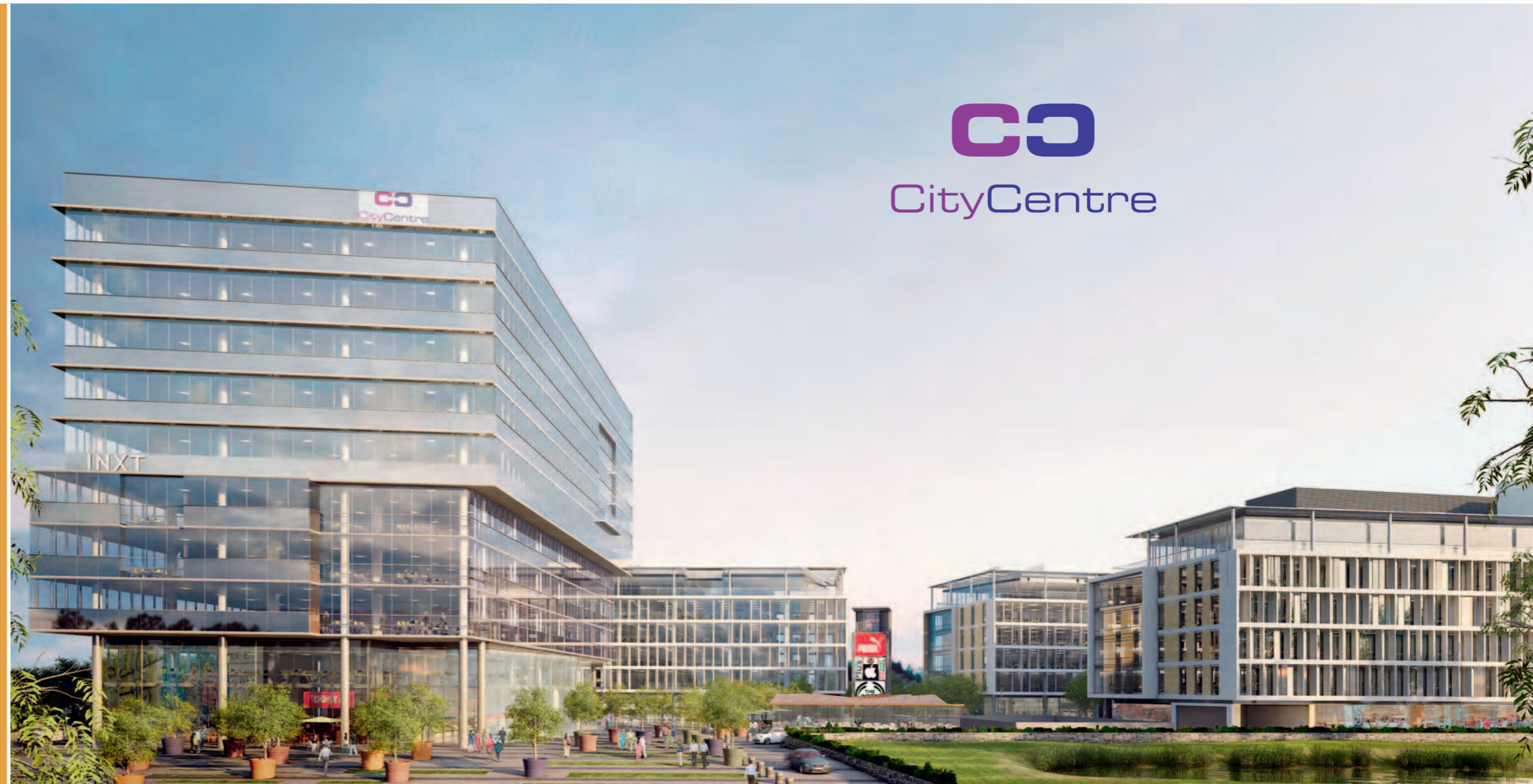
INXT City Centre – An enclave of six independent yet integrated blocks offering office, retail and hospitality spaces