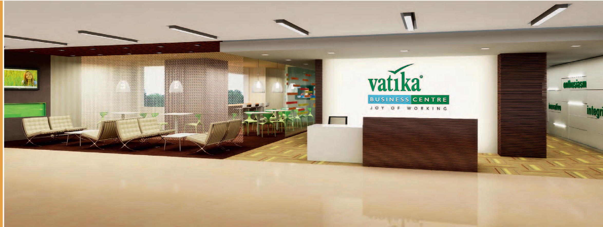
Perspective view of Vatika Business Centre at Vatika Business Park on Sohna Road, Gurgaon