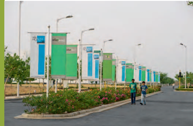
At Vatika Infotech City emphasis has been laid on street architecture