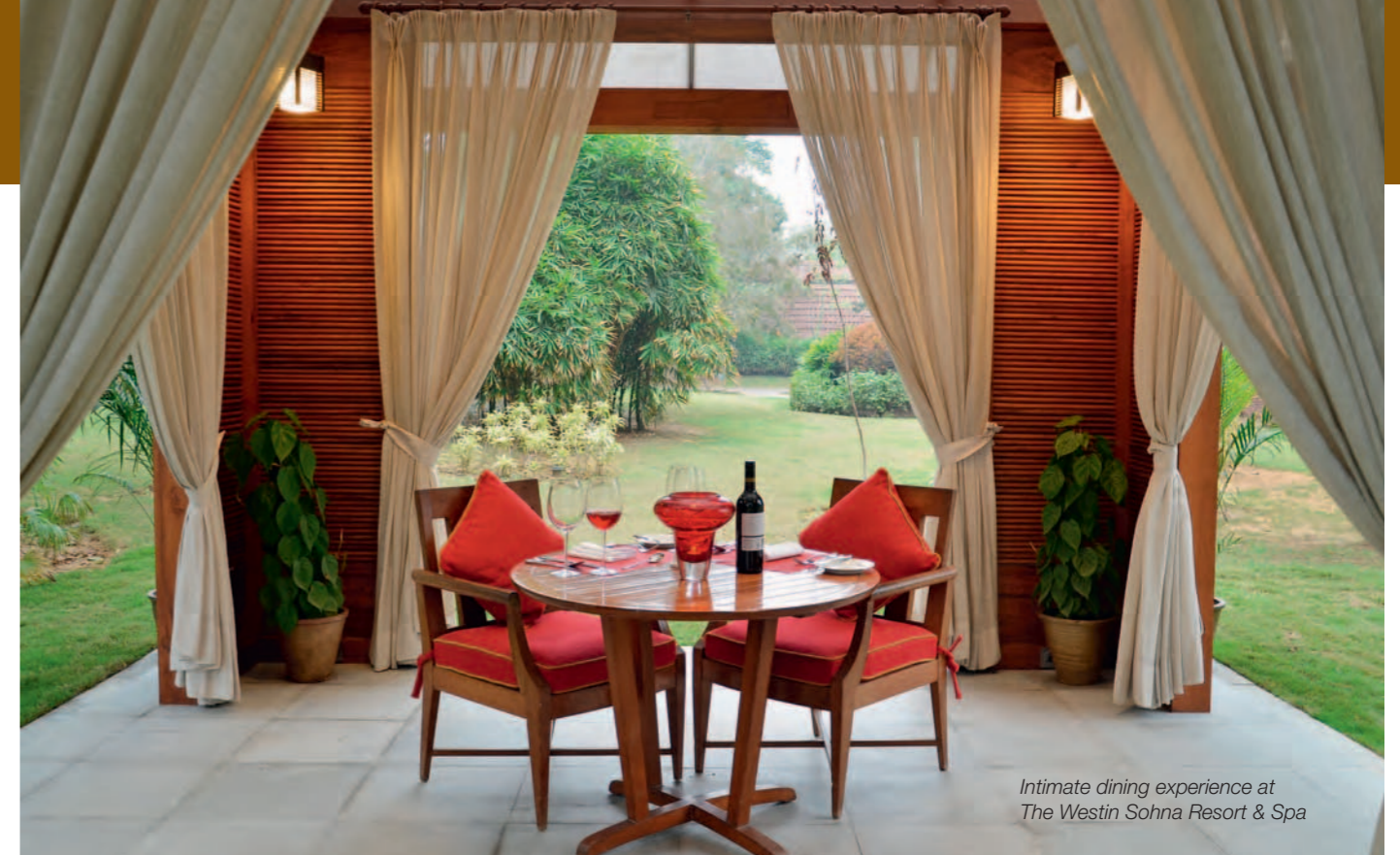
Intimate dining experience at The Westin Sohna Resort & Spa