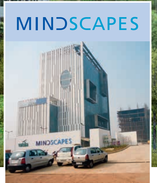
Vatika Mindscapes – A-Grade Commercial Complex on main Mathura Road is ready for fit outs