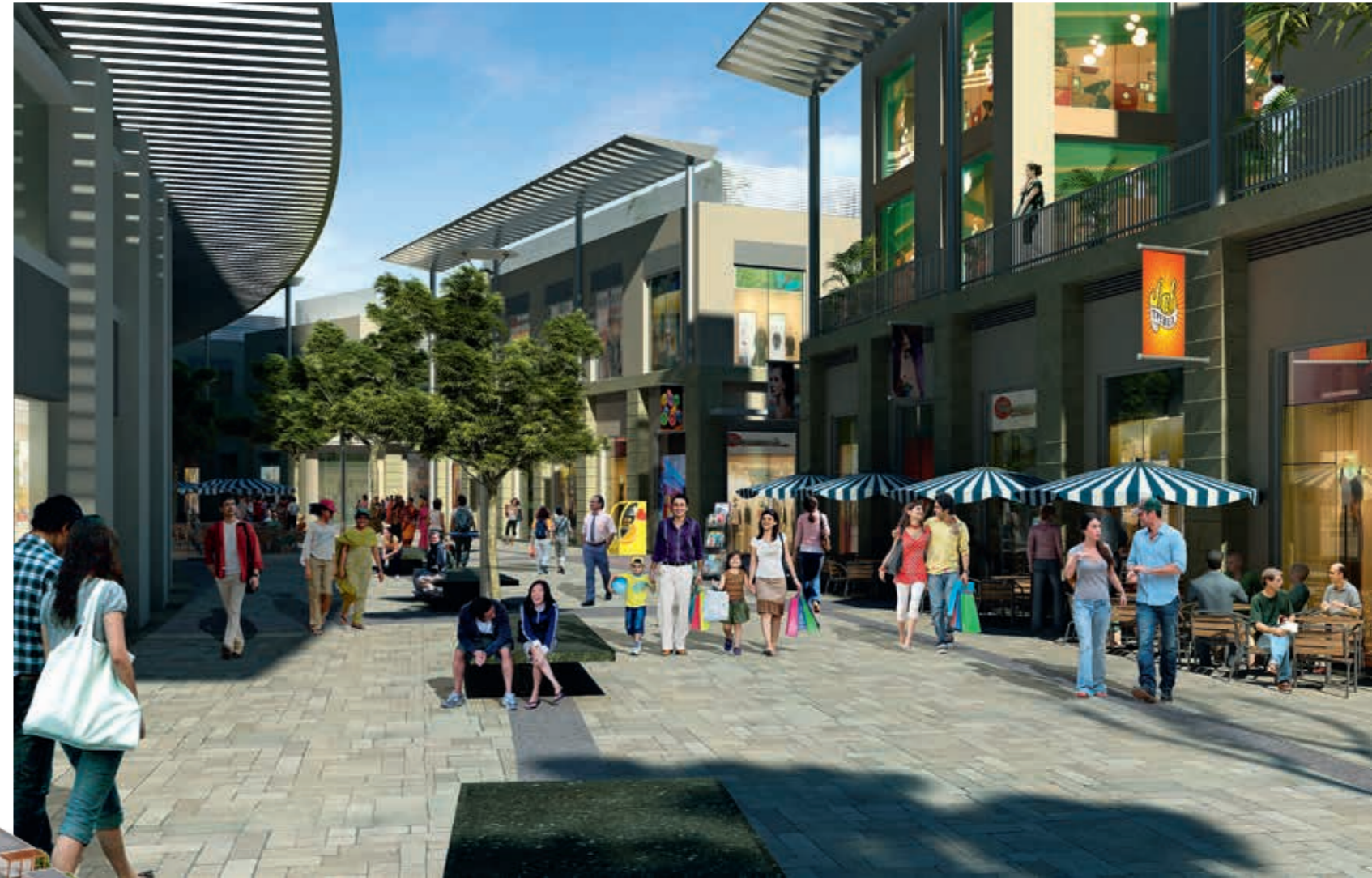
Town Square is an up-market retail cum commercial complex which will serve as the first choice shopping and entertainment centre for the residents of Vatika India Next