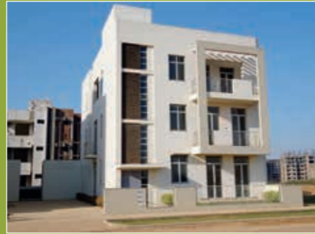
Mock apartment of INXT Floors ready