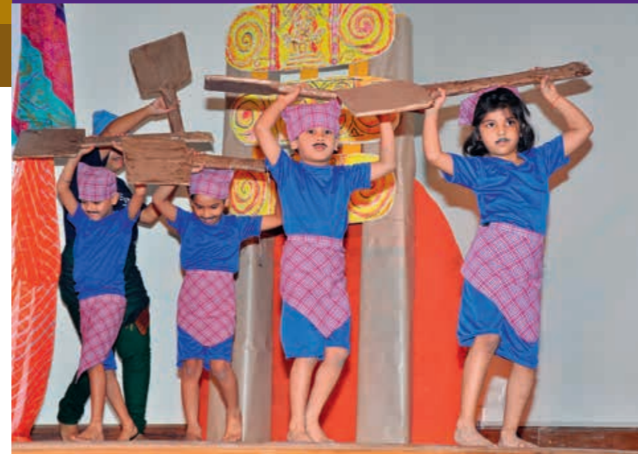
Children performing the Koli dance; a folk dance of the fishermen of Maharashtra