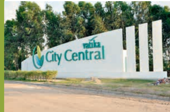
Entrance marker at Vatika City Central, Ambala