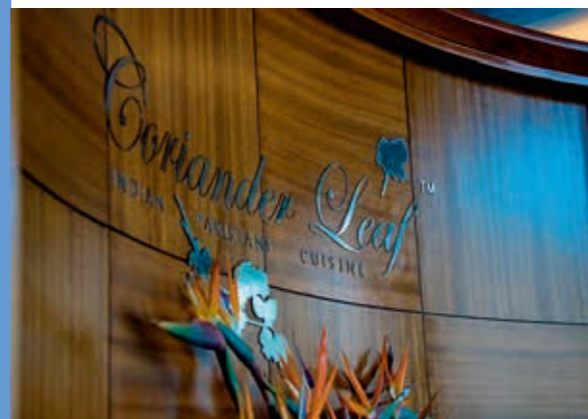
Coriander Leaf opens its second branch!