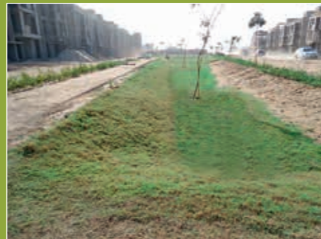
Development work of Parks in Vatika India Next in full swing