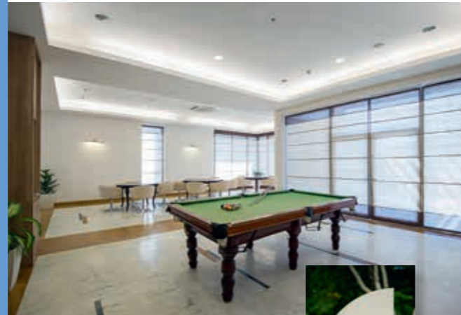
Urban Woods Club is operational with best in class interiors and facilities to meet all your social and recreational needs

Vatika Business Centre launched two new centres at MG Road and Sohna Road, Gurgaon and adds further 50,000 sq ft (more than 500 seats) of fully furnished shared office spaces, meeting rooms and virtual offices