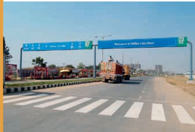
Construction of INXT, a 700 acre* mega integrated city, is in top gear and habitation has initiated for this dream city