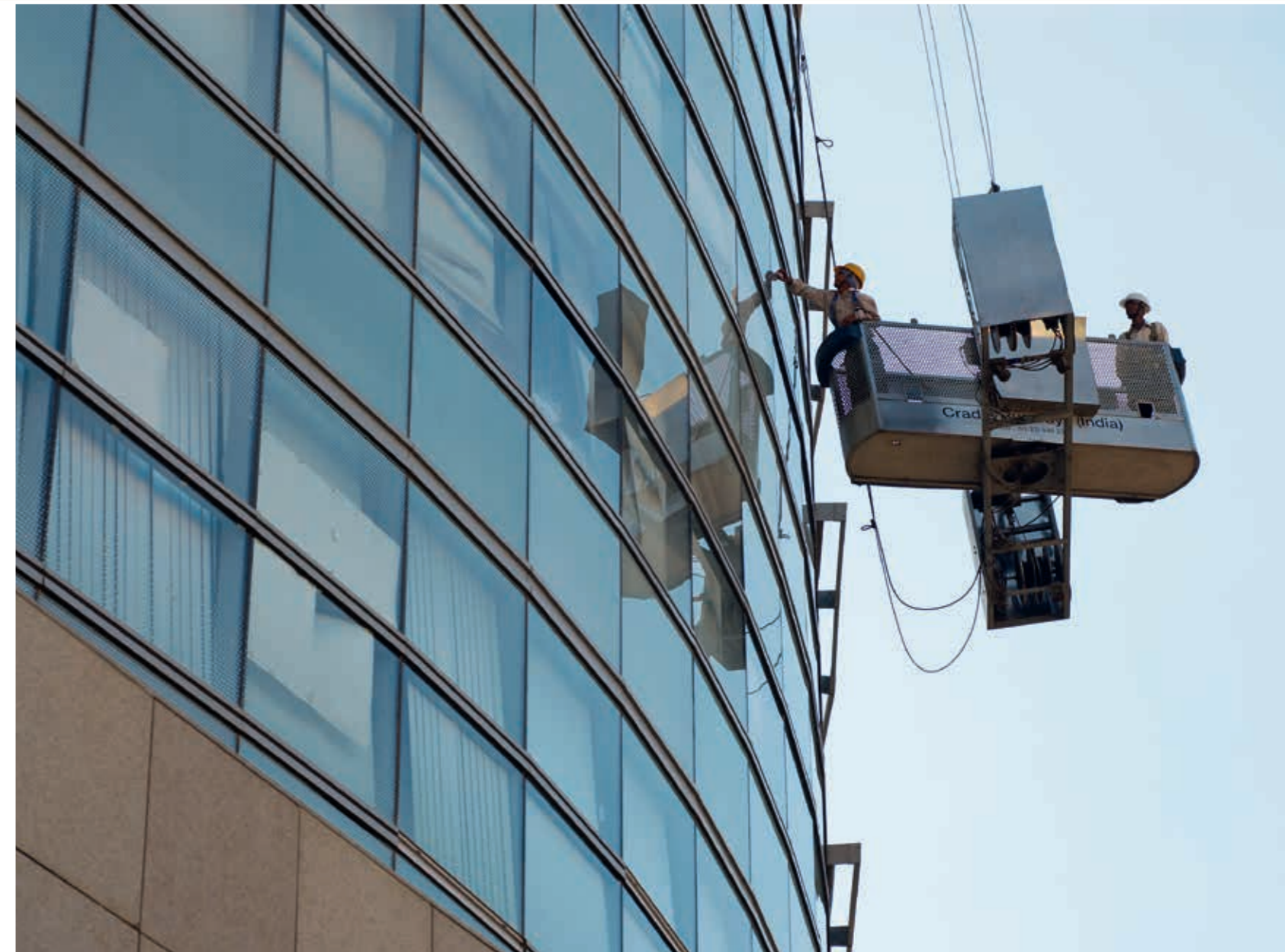
Enviro – Providing Customized and Optimized Solutions for Integrated Facility Management Services