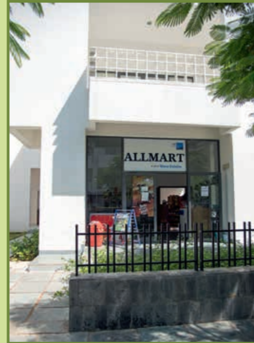
Retail outlets, that are central to daily living, are already functional; making life a convenient reality for the residents