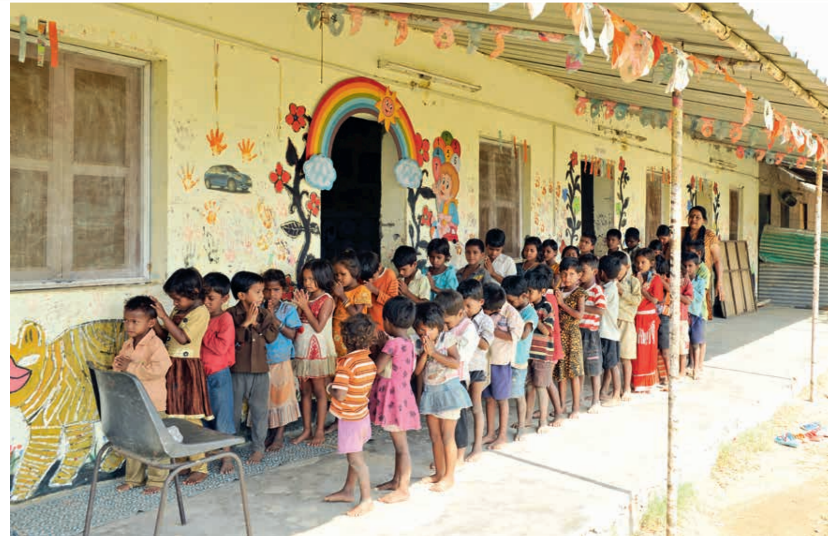
Day care at Vatika India Next, Gurgaon providing children with basic education and mid-day meals

The doctors visit the site twice in a month to conduct medical checkups and provide treatment and medicines to those in need