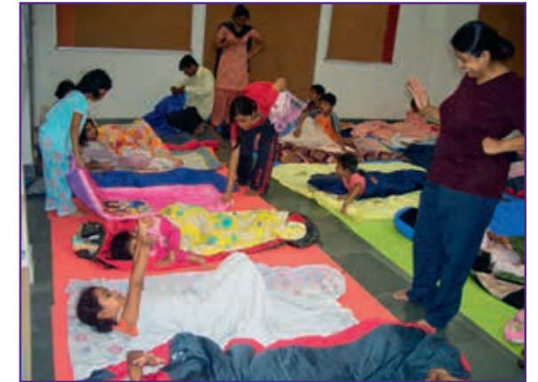
Night stay at school was great fun... children enjoyed their home away from home