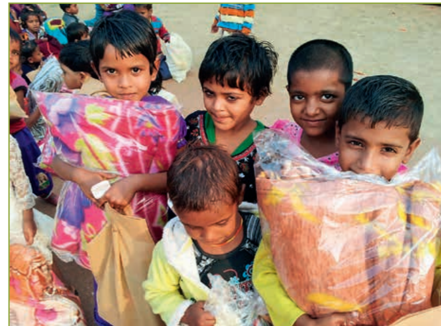
The children enjoyed the day with games, magic shows and dancing. Lunch was served along with chocolates and fruit juice. After the fun-filled day all the children went back with gifts, blankets, and best of all, a huge smile on their faces