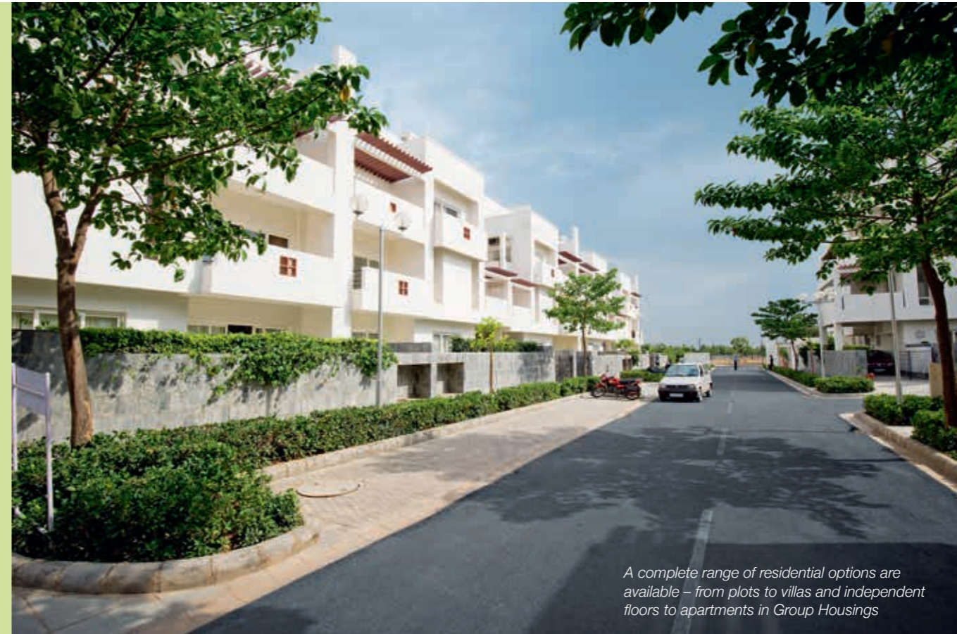
A complete range of residential options are available – from plots to villas and independent floors to apartments in Group Housings