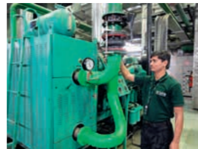
Technical maintenance and operations by Enviro