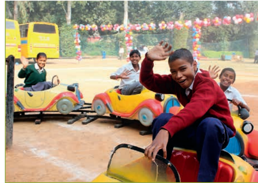
1,000 children came together to celebrate “Khushiyon ki bahaar” – Family Vision’s annual carnival for underprivileged children with support of VCare on 17th November 2012. These included slum children, ragpicker children, children of women prisoners, as well as blind children.

For running the day-care program for approximately 80 children of laborers at Vatika India Next – NH8 Gurgaon and 45 children at Vatika Infotech City, Jaipur. The crèche, apart from being a day care also provides basic education to primary students and assists in obtaining admission in schools for the older children. On special occasions, the children are encouraged to come together and participate in performing small skits, presentations, etc.