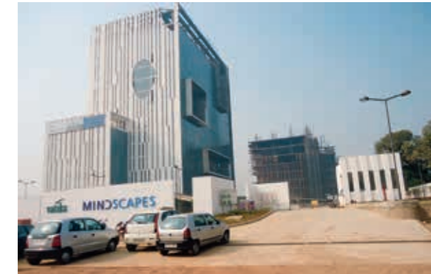
Vatika Mindscapes – An 'A' grade commercial complex is now ready for fit outs

Enviro is proud to announce addition of its latest client, Indraprastha Institute of Information Technology, Delhi (IIIT-D) to their portfolio. Enviro would be providing comprehensive Facilities Management Services encompassing Electromechanical Services, Housekeeping, Pest Control, Horticulture and Office Support Services