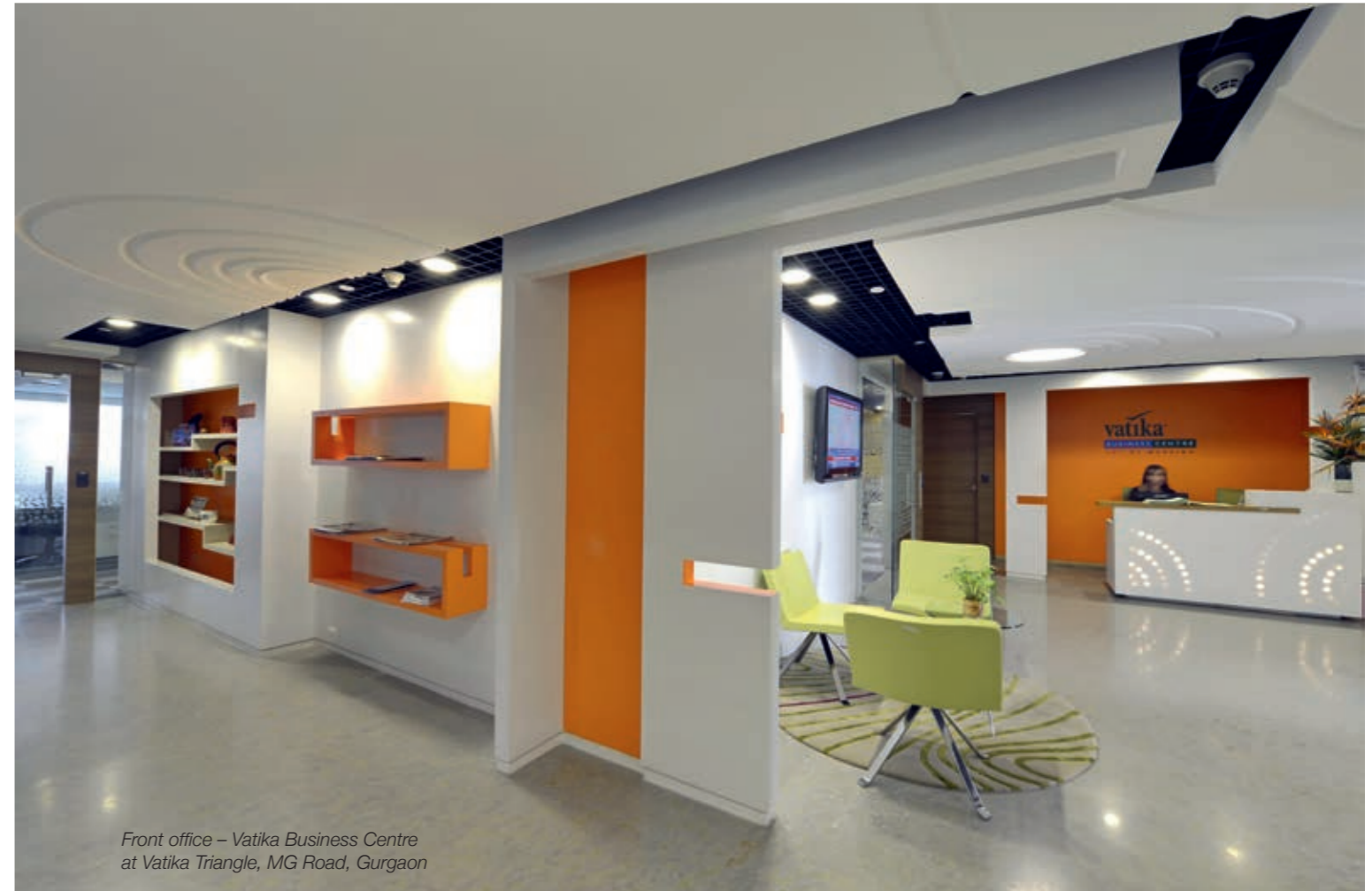
Front office – Vatika Business Centre at Vatika Triangle, MG Road, Gurgaon

New Delhi • Mumbai • Bangalore • Hyderabad • Gurgaon • Pune