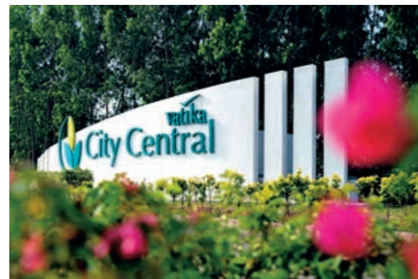
Entrance marker at Vatika City Central, Ambala