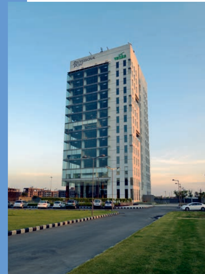
Another state-of-the-art commercial complex Professional Point - is ready for fits-outs