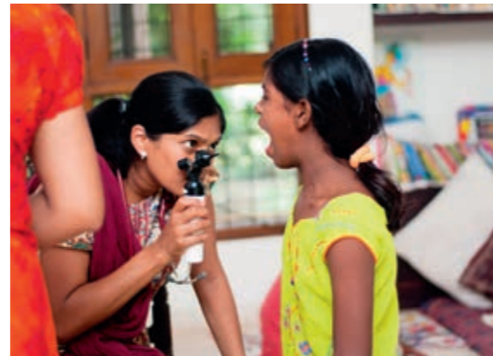
Top: Kid's theatre workshop organized at Harmony House Far Left: Children undergoing yoga training sessions Left: Doctor conducting dental checkups for children at Harmony House