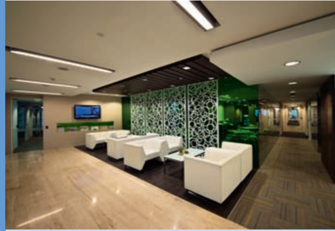
Plush waiting lounge at Vatika Business Centre

Enviro adds one of the mega townships in Delhi/NCR as their clients. Enviro would now be servicing the 700 acres* township - Vatika India Next in Gurgaon