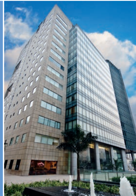
Vatika Business Park has been awarded 'Highly Commended High-Rise Commercial Development' of India at the Asia Pacific Property Awards 2013-14

Vatika Business Park, Gurgaon has been awarded as the 'Highly Commended High-Rise Commercial Development' in the country