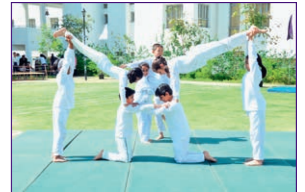
Children form a pyramid as part of the Khel Utsav celebrations