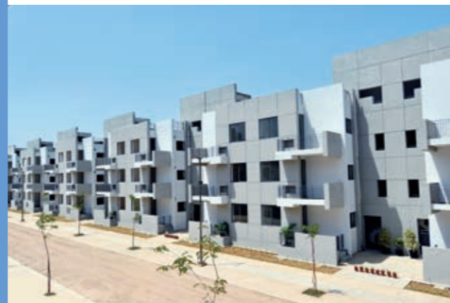
Independent Floors - ready for habitation at Vatika INXT, Gurgaon