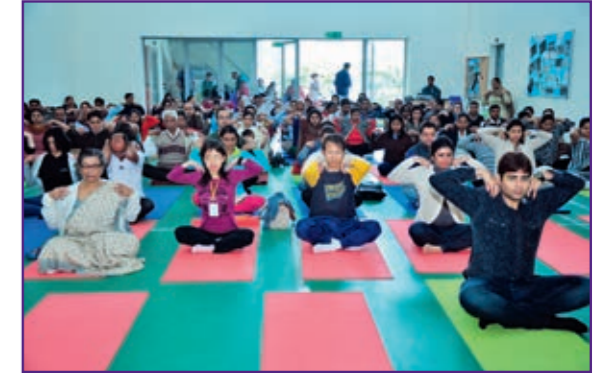
Parents engaged in a guided Yoga and Meditation session