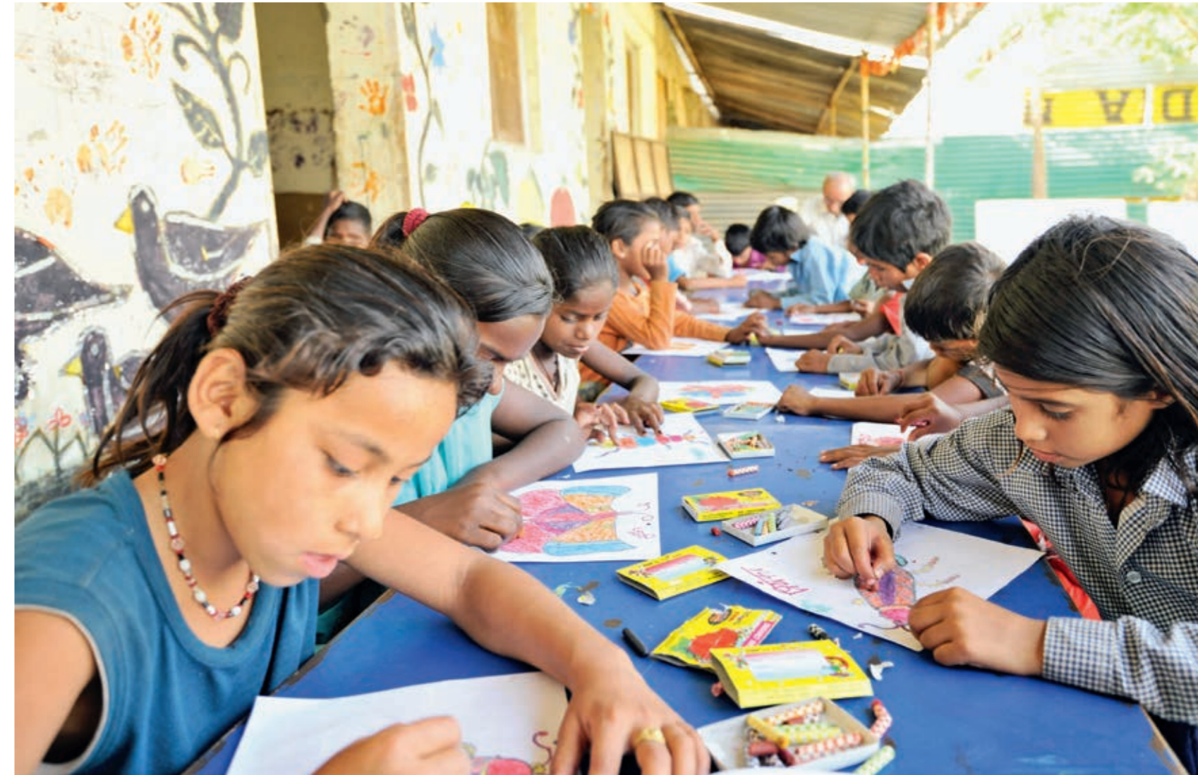
Day care at Vatika India Next, Gurgaon providing children with basic education and mid-day meals

Smile-on-wheels is the CSR initiative of VCare in agreement with the Smile Foundation. The Smile Foundation works in the field of Health, Education and Women Empowerment. The mobile medical van thus provides comprehensive mobile healthcare services for all construction workers and their families, largely engaged by various contractors at Vatika India Next. The doctors visit the site twice in a month to conduct medical checkups and provide treatment and medicines to those in need