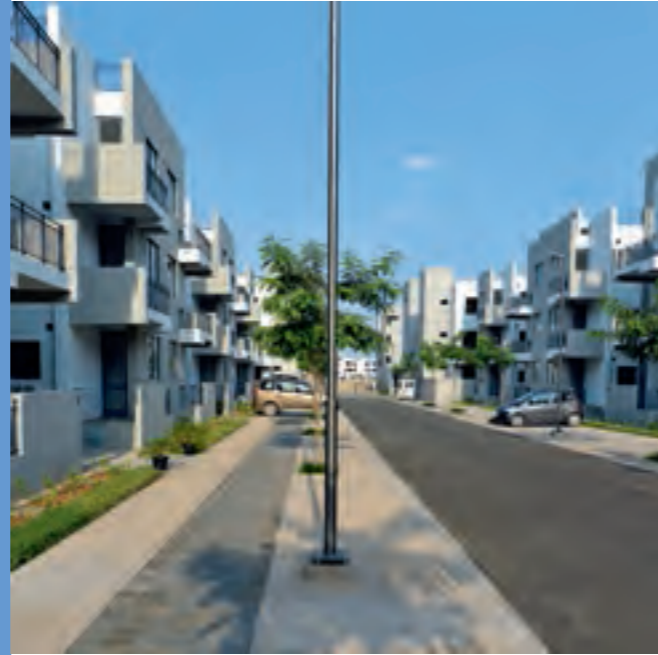
Residents at INXT Independent Floors enjoy large open spaces, tree-lined streets, security, broad walkways and easy access to all township amenities