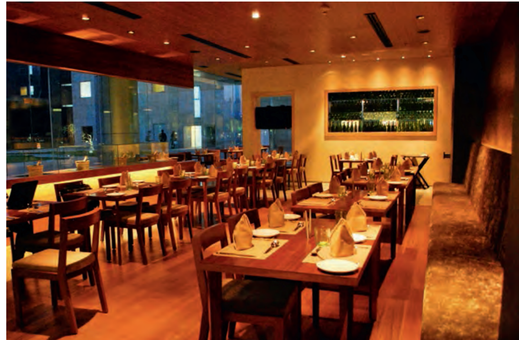
Coriander Leaf – Authentic Indo-Pak fine dining destination