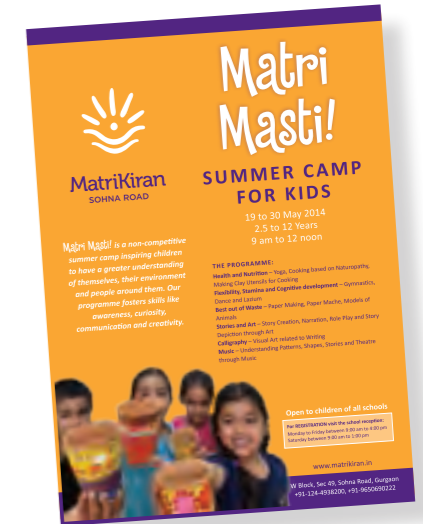
Matri Masti is a summer camp organised by MatriKiran school