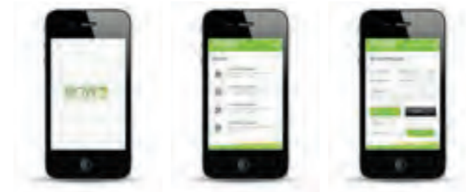
Enviro Mobile application is now live!

1 In an attempt to make communication more efficient and interactive for the clients, Enviro has launched its Mobile App. The App facilitates registration of service requests, updating clients with latest news and events, information about Enviro and its services, and many other features which makes it easier and faster for our clients to reach us