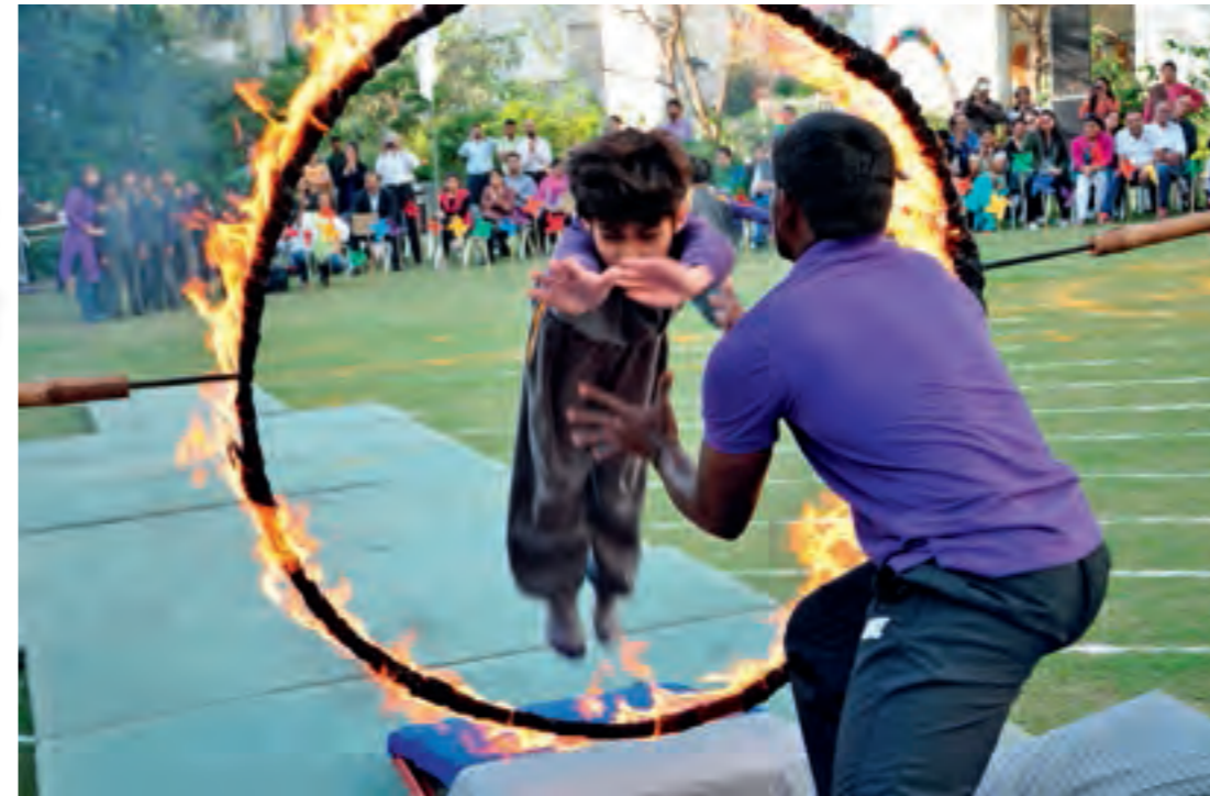
Children fearlessly somersaulted through the fire ring as part of Khel Utsav demonstrations

Gymnastics skills... Passing through the Fire Ring during Khel Utsav... Participation in Raahgiri, an outdoor initiative taken by people living in Gurgaon... Interaction with the children of 'Radiant kids', an informal school at Jharsa Village, where over 200 less privileged children, aged between 2.5 to 18 years are receiving educational, remedial, extracurricular and life skill inputs on a regular basis