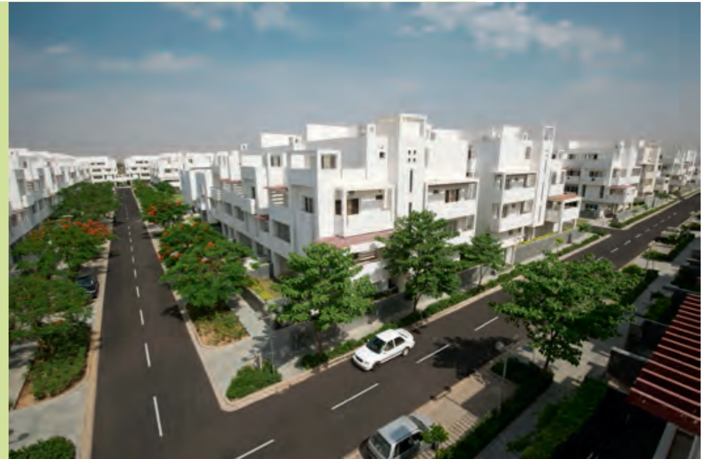
The two avenues in Urban Woods are lined with evergreens, while its five streets bear the names of five beautiful flowering trees. All roads within Urban Woods are at least 50ft wide, with clearly demarcated walkways