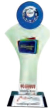
Coriander Leaf bags the Indian Hospitality Award