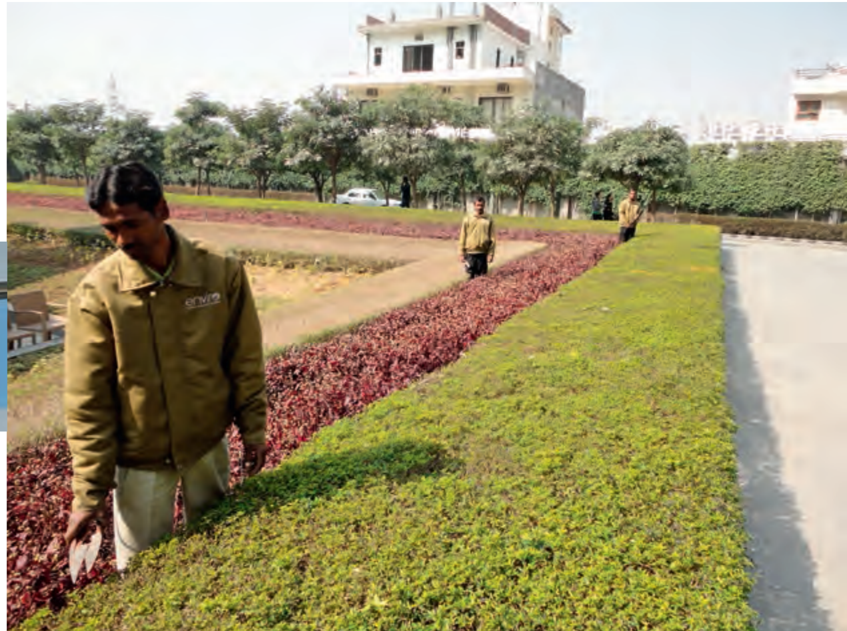
Enviro's award winning horticulture services, maintaining beautiful landscapes across all our estates