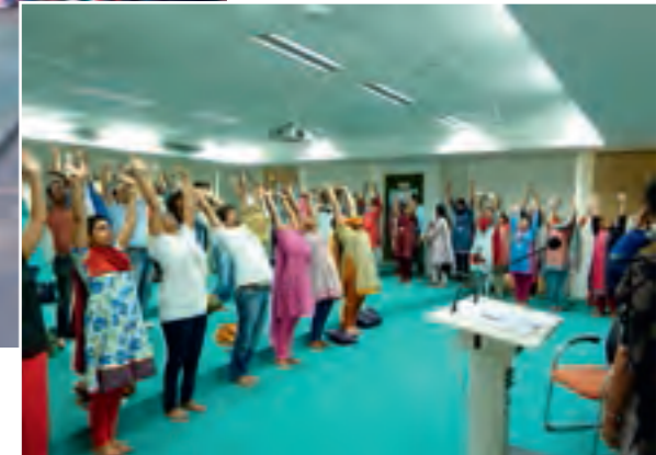
Mind and Body Awareness exercises for parents during the Orientation Session

3 Extensive usage of laboratories for experiments, library for research work and audio-visual hall for presentations