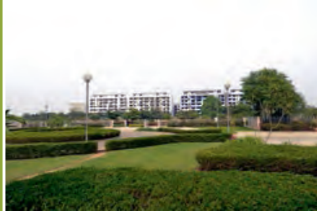
Overlooking acres of greens, The Park Apartments are ready for the residents to move in