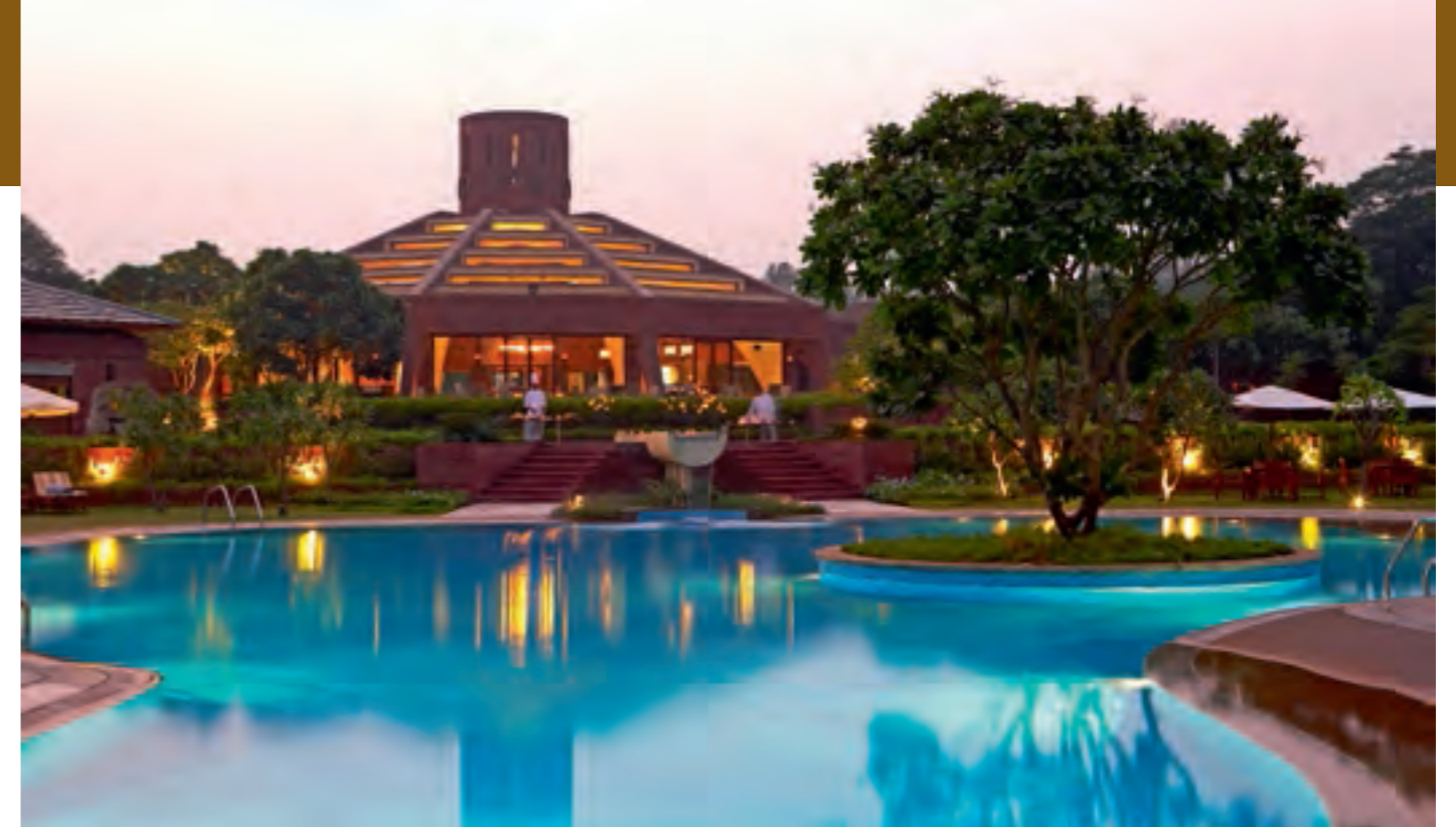
Weddings at The Westin Sohna Resort & Spa

Winner of Best Business Hotel for Women Travellers in India by Travel and Leisure South Asia