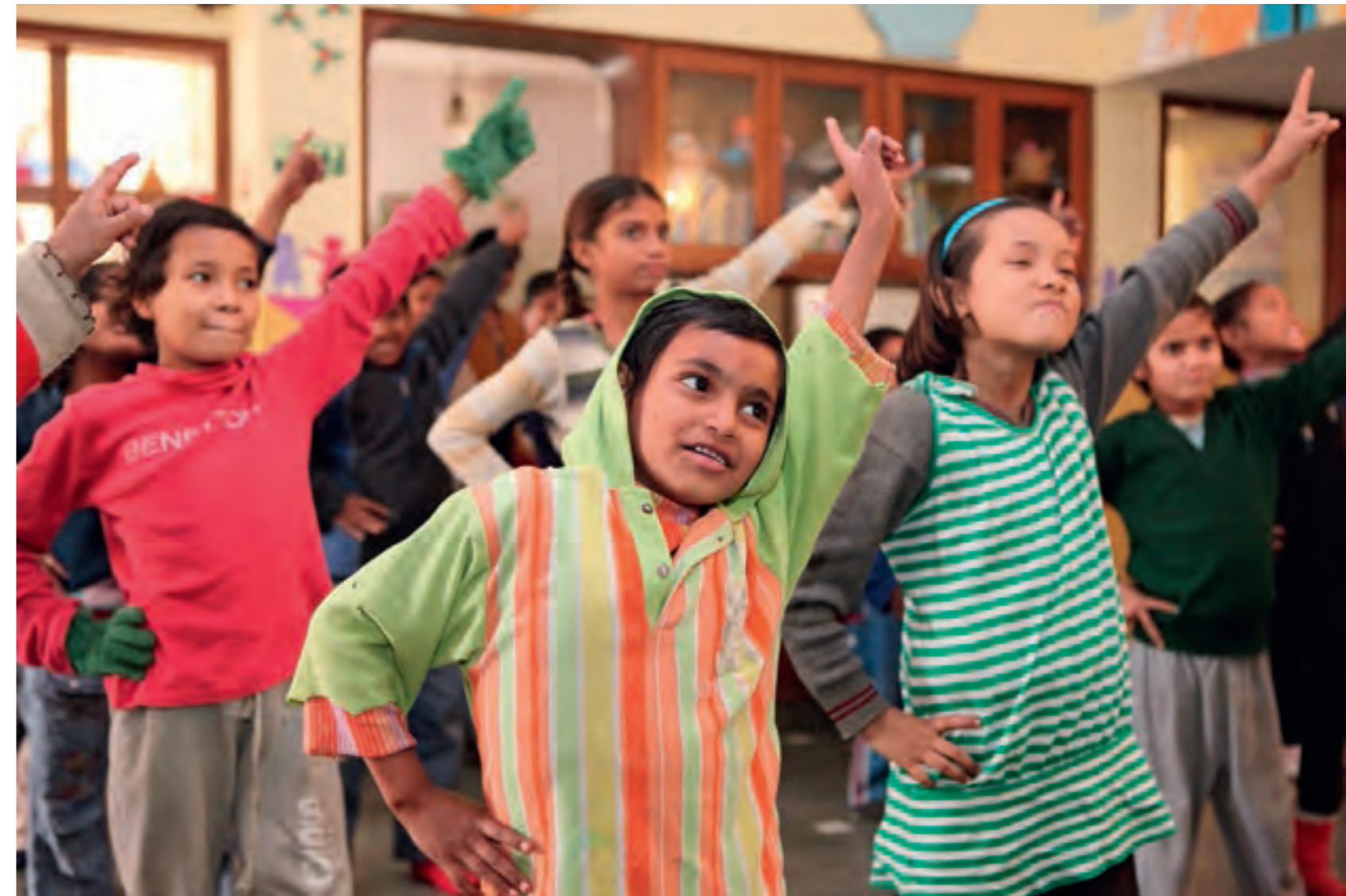
Kid's theatre workshop organised at Harmony House

The doctors visit the site twice in a month to conduct medical checkups and provide treatment and medicines to those in need