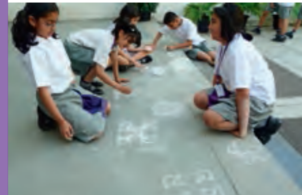
Children making 'Kolam', the traditional rangoli of Tamil Nadu made using rice powder