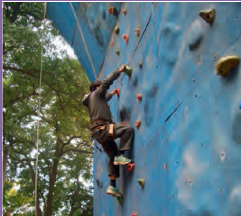
Rock climbing at the Indian Mountaineering Foundation, New Delhi