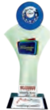
Coriander Leaf bags the Indian Hospitality Award

1 Coriander Leaf is proud to win the prestigious 'Indian Hospitality Award' for being the 'Best Restaurant in Gurgaon' awarded by Epicurus Hospitality