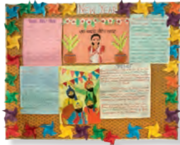
Display boards keep the children positively stimulated and well informed

Gymnastics skills... Passing through the Fire Ring during Khel Utsav... Participation in Raahgiri, an outdoor initiative taken by people living in Gurgaon... Interaction with the children of 'Radiant kids', an informal school at Jharsa Village, where over 200 less privileged children, aged between 2.5 to 18 years are receiving educational, remedial, extracurricular and life skill inputs on a regular basis