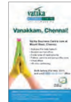
Joy of working is doubled with the launch of new business centres at Chennai and New Delhi