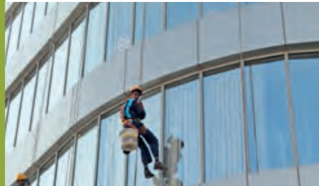
Enviro's highly skilled team of service providers