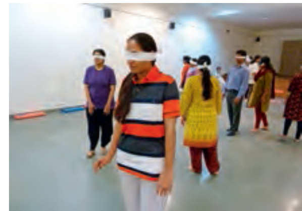
Consciousness Workshop conducted by an expert in the field of yoga and integral growth for Facilitators

6 Differently abled children are gradually achieving their milestones