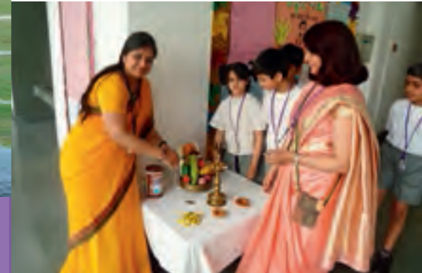
Setting up the traditional 'Kani' which consists of vegetables, fruits, coconut, betel leaves, flower, coins etc, during Tamil New Year celebrations