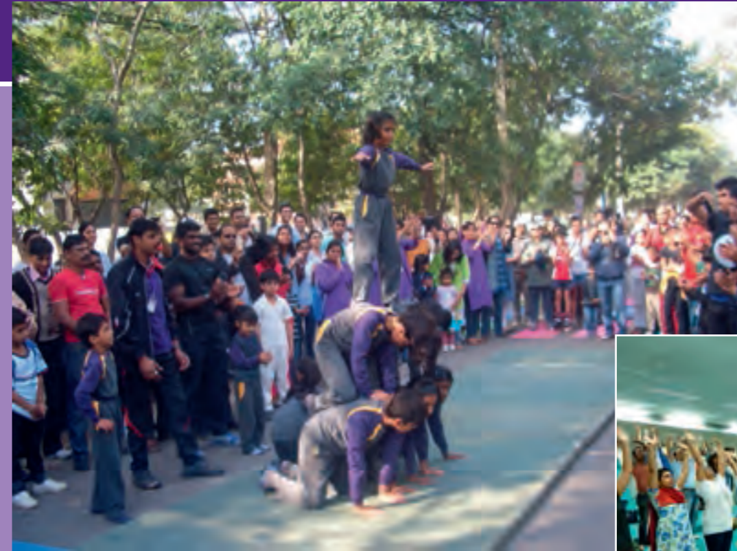
Demonstrating the importance of balance and team work through pyramids and gymnastics, at Raahgiri, Gurgaon