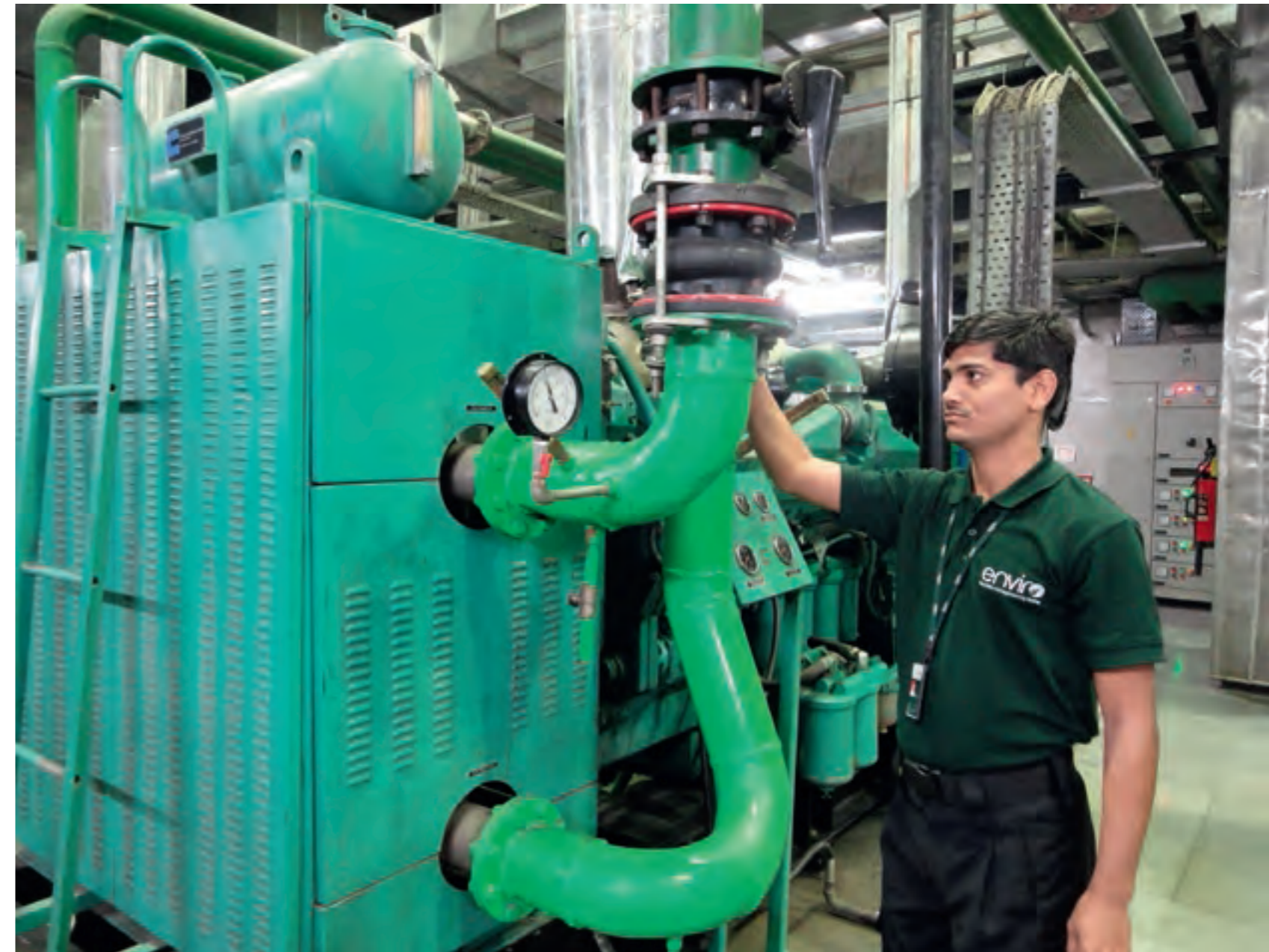
State-of-the-art equipment managed by Enviro's professionally trained team