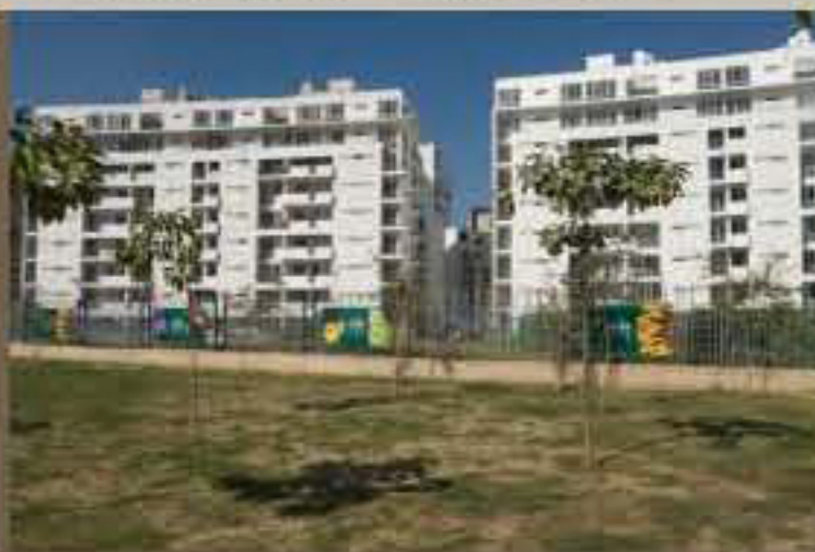
View of Vatika City