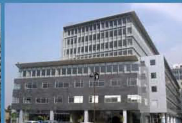
Actual Shot, Vatika Business Park