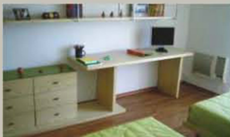
Sample Flat, Urban Woods, Jaipur