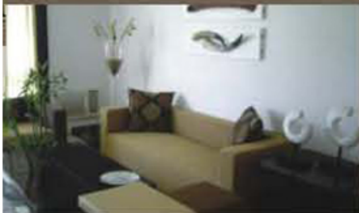
Sample Flat - Urbanwoods, Jaipur