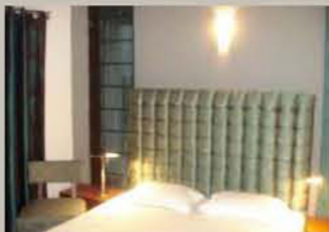
Master Bedroom, Sample Flat, Vatika City Centre