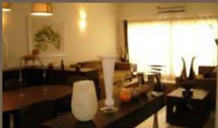
Sample Flat, Urbanwoods, Jaipur