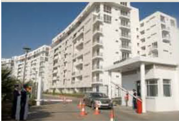
Entrance, Vatika City, Gurgaon