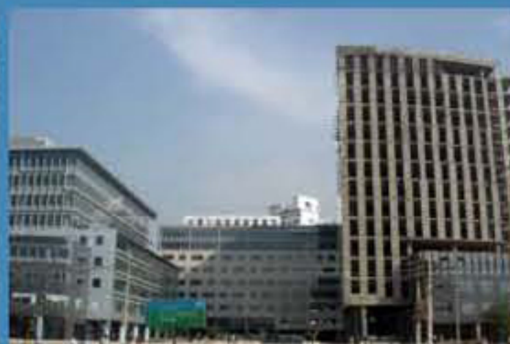
Actual Shot, Vatika Business Park