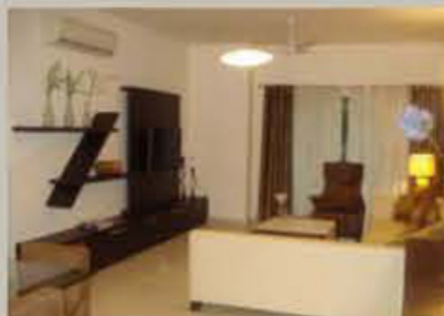
Living Room, Sample Flat, Vatika City Centre