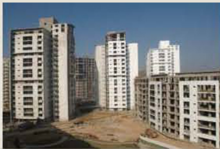
View of Sovereign Apartments with Acacia and Calmson Park