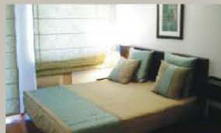
Sample Flat, Urban Woods, Jaipur

Sample flat ready and development work is in full swing at this 170 acres township.