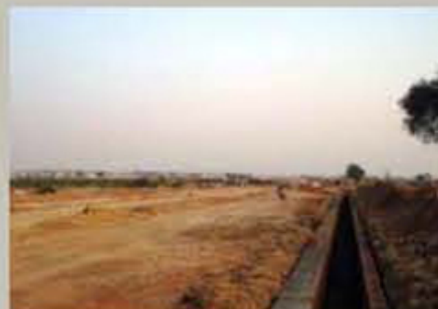
Construction Work, Vatika City Centre