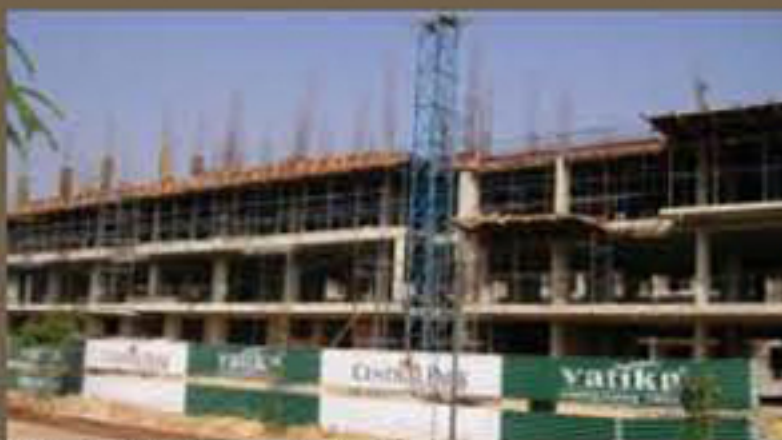
Block G - Central Park Apartments, Jaipur