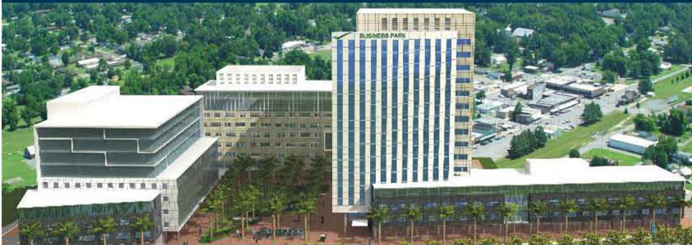
Aerial View, Vatika Business Park