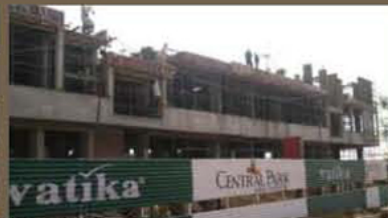
Block H - Central Park Apartments, Jaipur