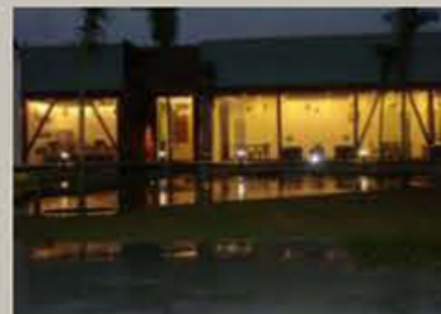
Sample Flat, Vatika City Centre