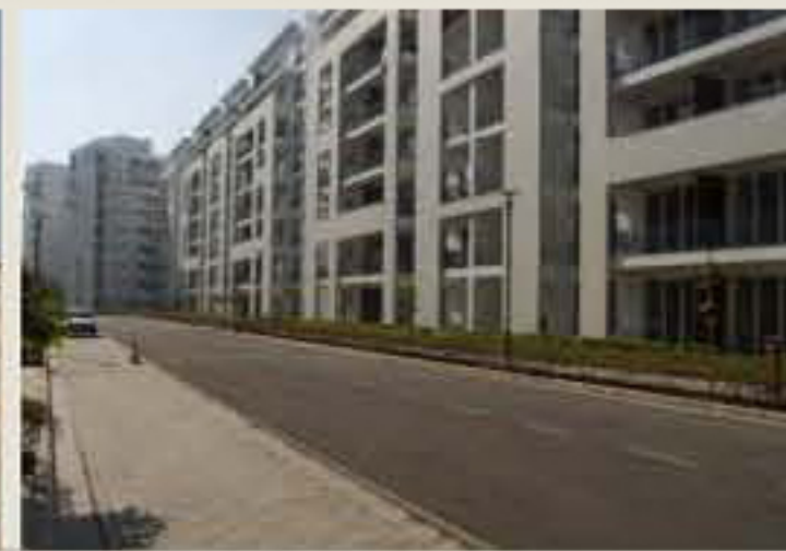
View of Primrose with Emilia in the back