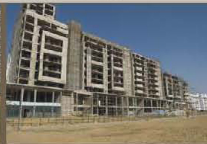
block with retail on ground floor