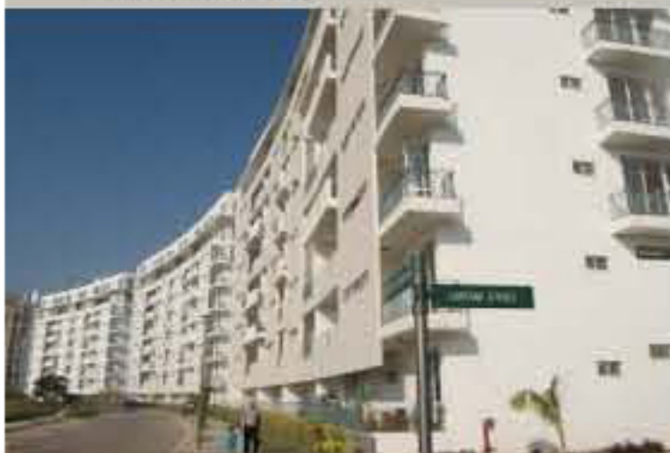
View of Emilia Apartments