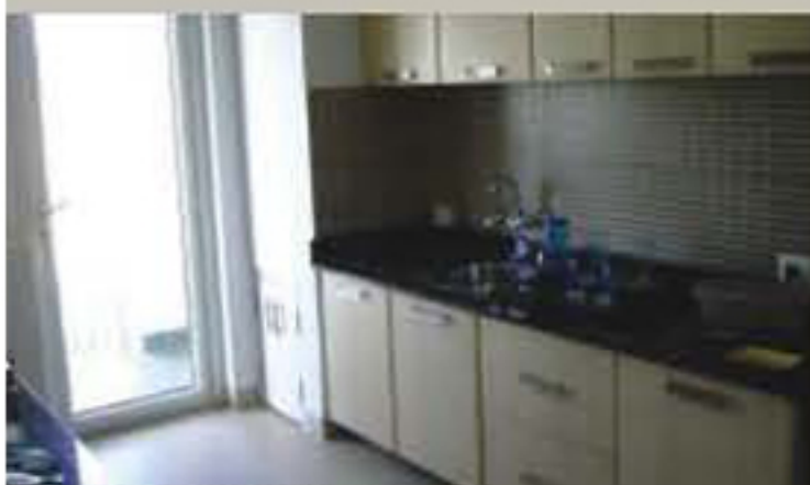
Sample Flat, Urban Woods, Jaipur