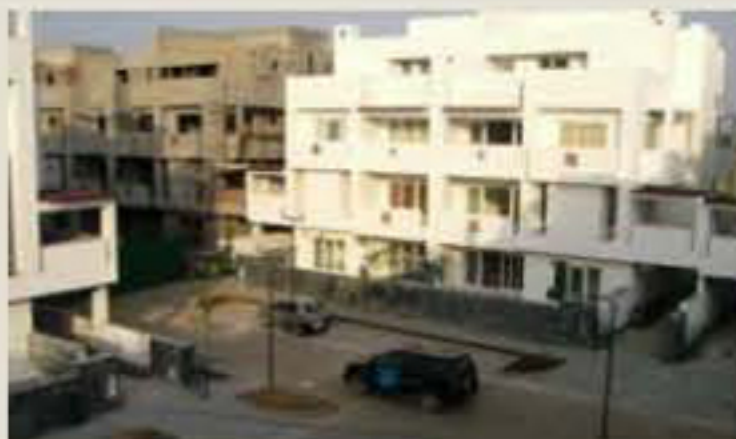
Block A, Backside - Urbanwoods, Jaipur