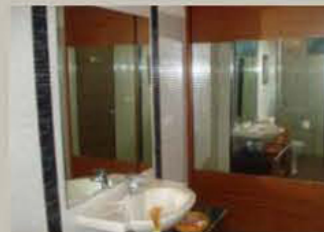
Washroom, Sample Flat, Vatika City Centre