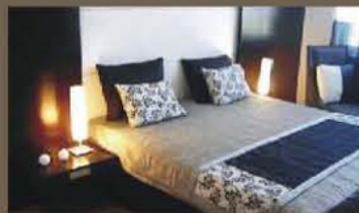
Sample Flat, Urbanwoods, Jaipur