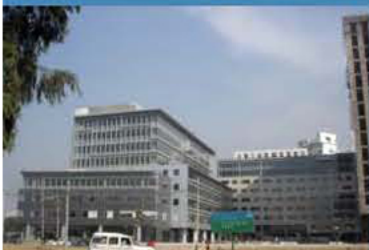
Actual Shot, Vatika Business Park

We are handing over Business Park, a 1 million sq.ft IT Park at Sohna Road Gurgaon to its prestigious clients