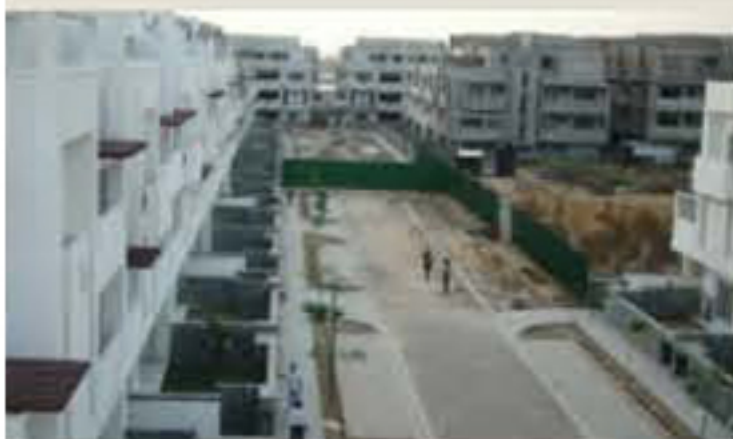
Block A - Urbanwoods, Jaipur