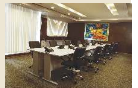
Meeting Room at Vatika Business Centre at First India Place, Gurgaon