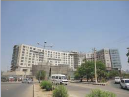
The Westin Gurgaon