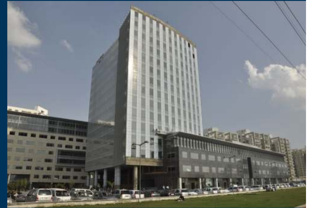
Vatika Business Park, Gurgaon