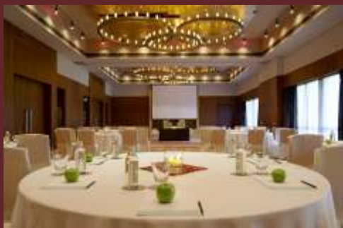
The Westin Vatika Ballroom