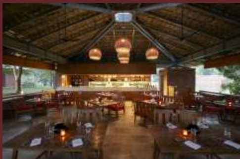
Xiao Chi - Signature Chinese Restaurant