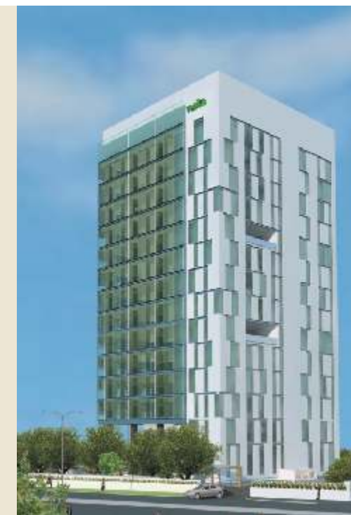
Perspective view of Vatika Professional Point