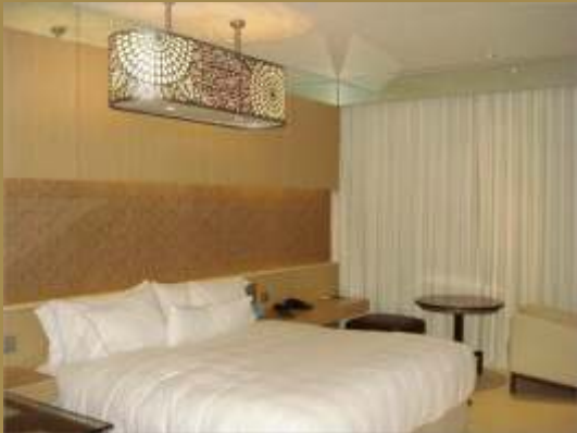
The Westin Gurgaon, Mock Room