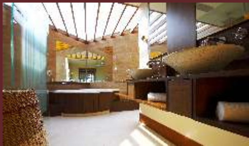
Studio Suite bathroom with sky roof