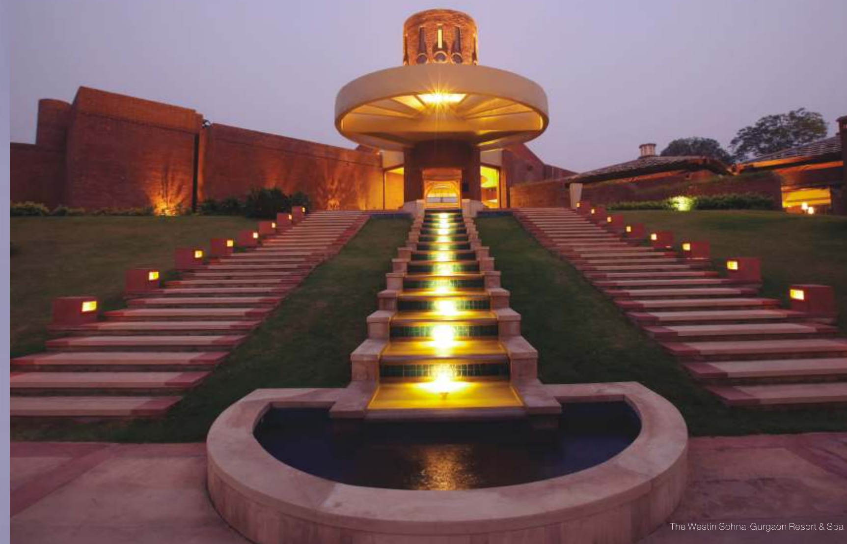
The Westin Sohna-Gurgaon Resort & Spa

In a chaotic, often stressful, busy world, it is important to relax and refresh. Vatika hotels and restaurants offers you the finest and widest choice of experiences for that perfect indulgence.