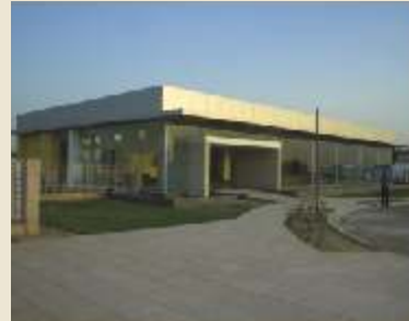
Marketing Lounge, Vatika Infotech City