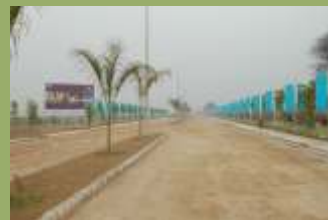
Construction work at site