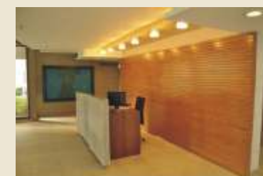
Business Lounge at Sovereign Apartments