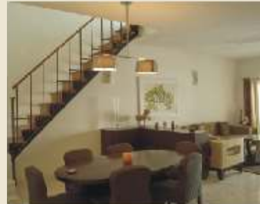
Sample Apartment, Urban Woods