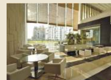
Lobby at the Clubhouse