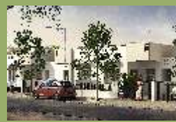
Street view of Ivy Homes

A development project beyond concrete-and-steel, a place with parks, trees, and lots of greens, where the air is fresh and clean. Making it not only a place to invest, but more importantly a place to live.