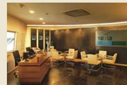
Reception at Vatika Business Centre at First India Place, Gurgaon