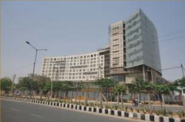
The Westin Gurgaon

The Westin Gurgaon, New Delhi will be the newest addition to the emerging central business district of Gurgaon.