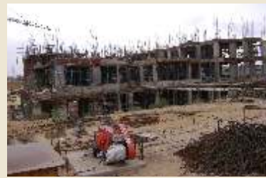
Aqua - Construction in progress - Jaipur 21