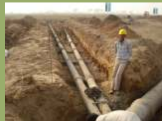
Construction work at site