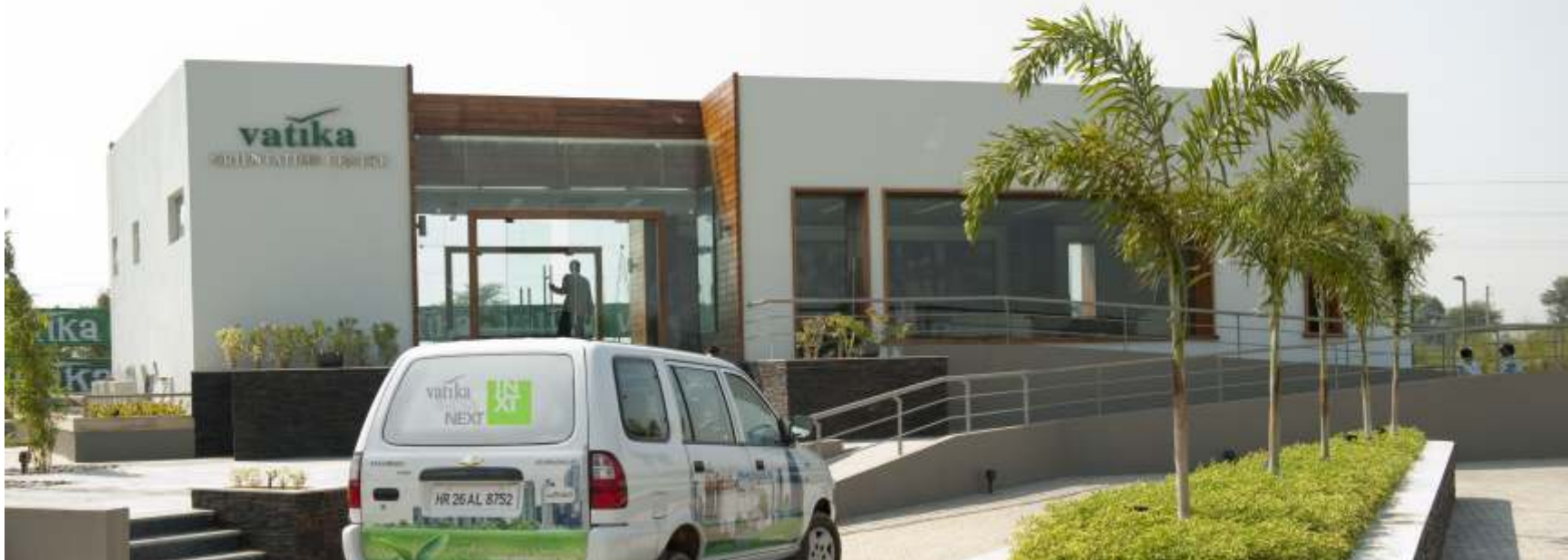
Development Update at Vatika India Next

Your new world is taking shape - Vatika India Next Step by step, Vatika India Next is progressively taking shape. And the wait is going to be worth every minute.