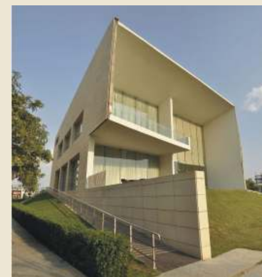
Vatika City Clubhouse