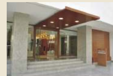
Entrance at Sovereign Apartments

We proudly announce “MatriKiran” - a primary school for Vatika City residents