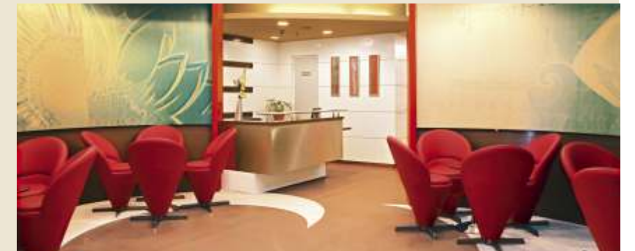
Reception at Vatika Business Centre at Vatika Atrium, Gurgaon

Operational centres in Gurgaon, Pune & Hyderabad. Opening soon in Bangalore & Mumbai.