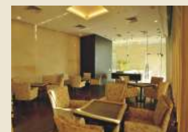
Cards Room at the Clubhouse