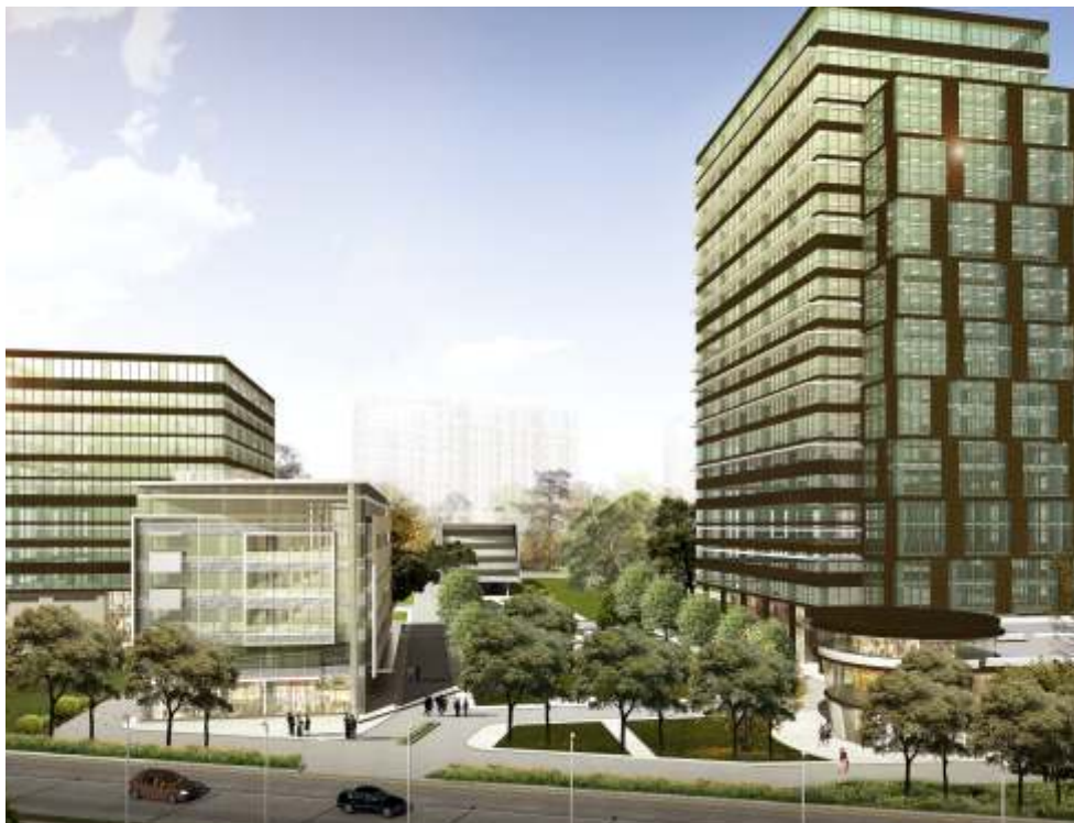
Perspective View of World Trade Centre, Gurgaon