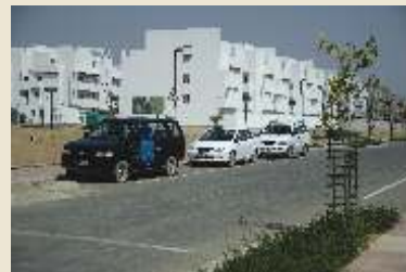
Phase I development at Urban Woods