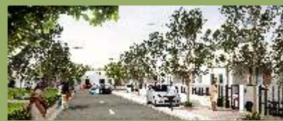
Street view of Ivy Homes