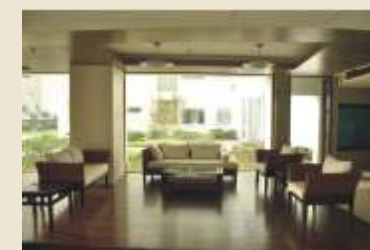
Business Lounge at Sovereign Apartments