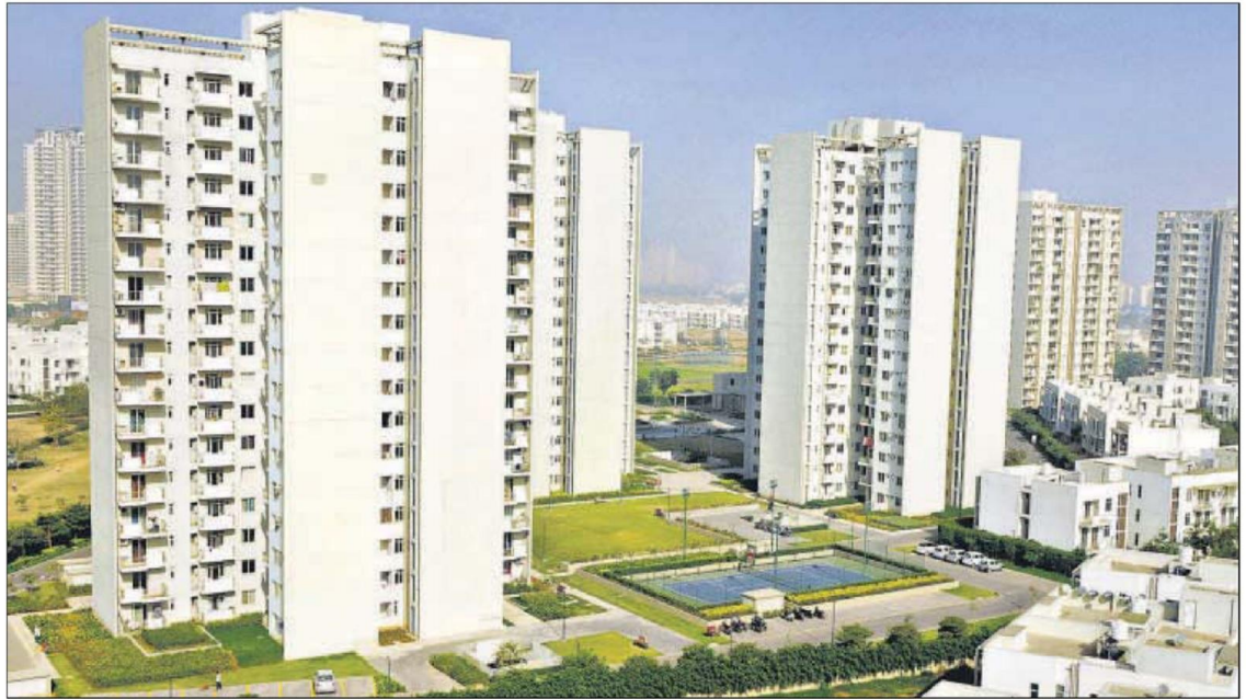
The seven towers are based on Ruskin's seven principles of architecture - sacrifice, truth, power, beauty, life, memory and obedience.

Recently, a call centre was set up for the condo's residents so they can direct queries and suggestions there. A mobile application also takes care of their billing needs.